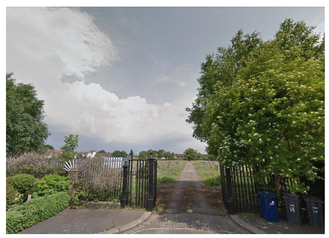
Havelock Cemetery – Church Avenue Entrance

There are 83 Commonwealth War Graves located in Havelock Cemetery, Southall – 39 from World War 1 & 44 from World War 2.