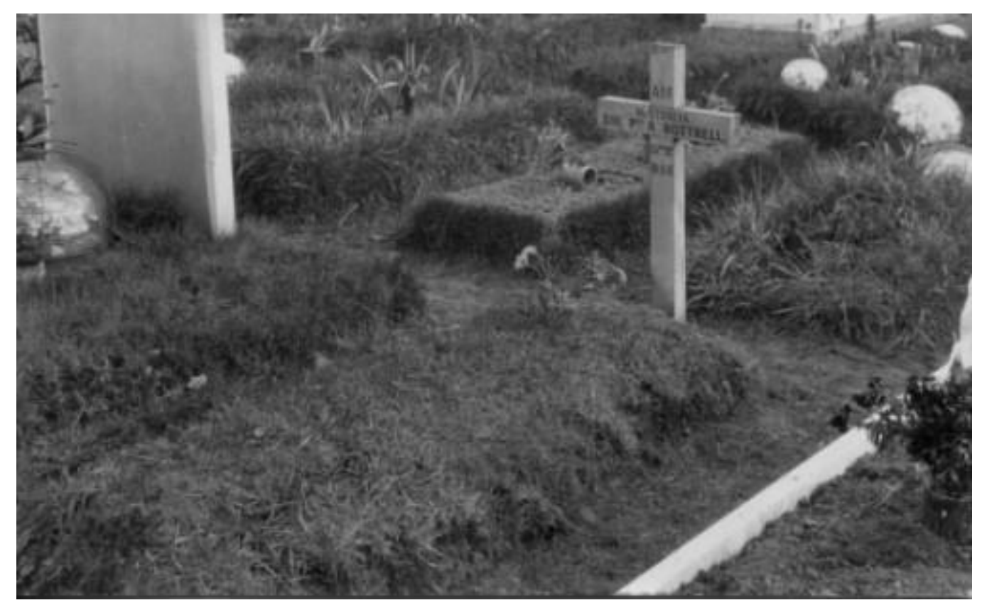
Original Cross Maker for Private Arthur Bottrell's grave