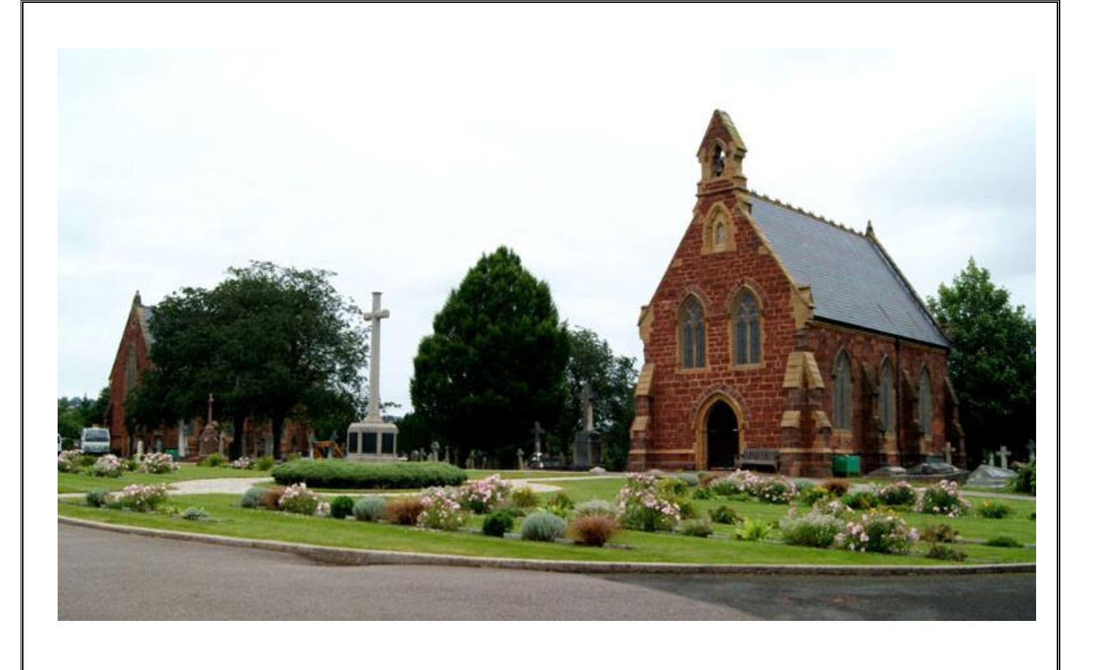
The World War 1 plots near the Memorial with plants & flowers between the named granite grave markers