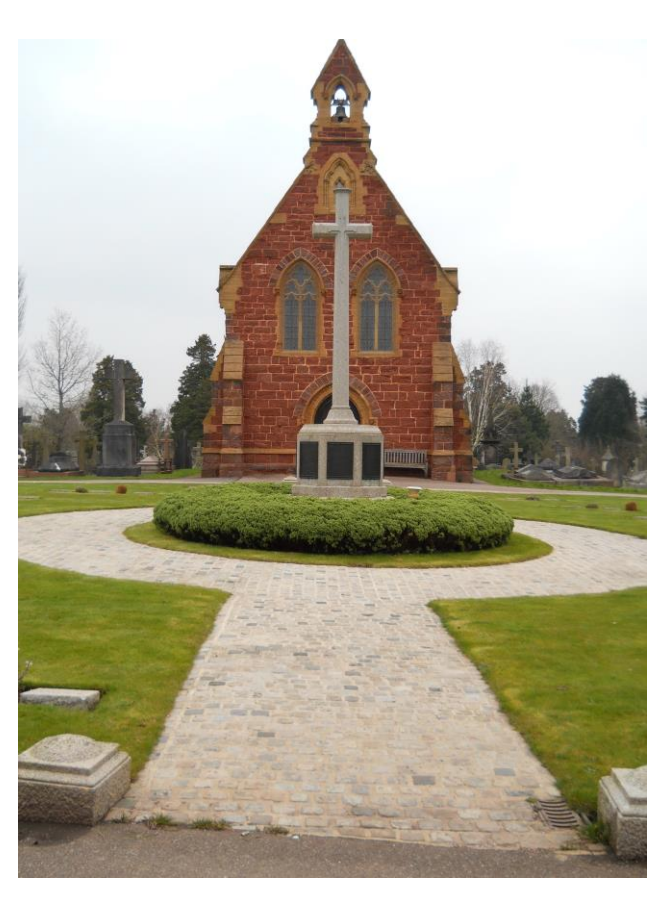
\label{thm:continuous} The \ Memorial \ (above) \ \& \\ \ (below) \ the \ plaques \ with \ the \ names \ of \ the \ soldiers \ buried \ in \ the \ World \ Ward \ 1 \ plot.