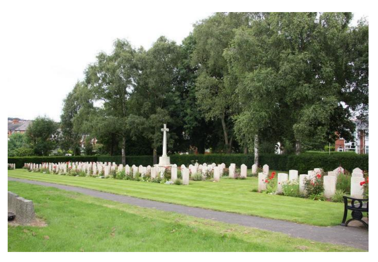
Exeter Higher Cemetery showing Cross of Sacrifice & World War 2 War Graves