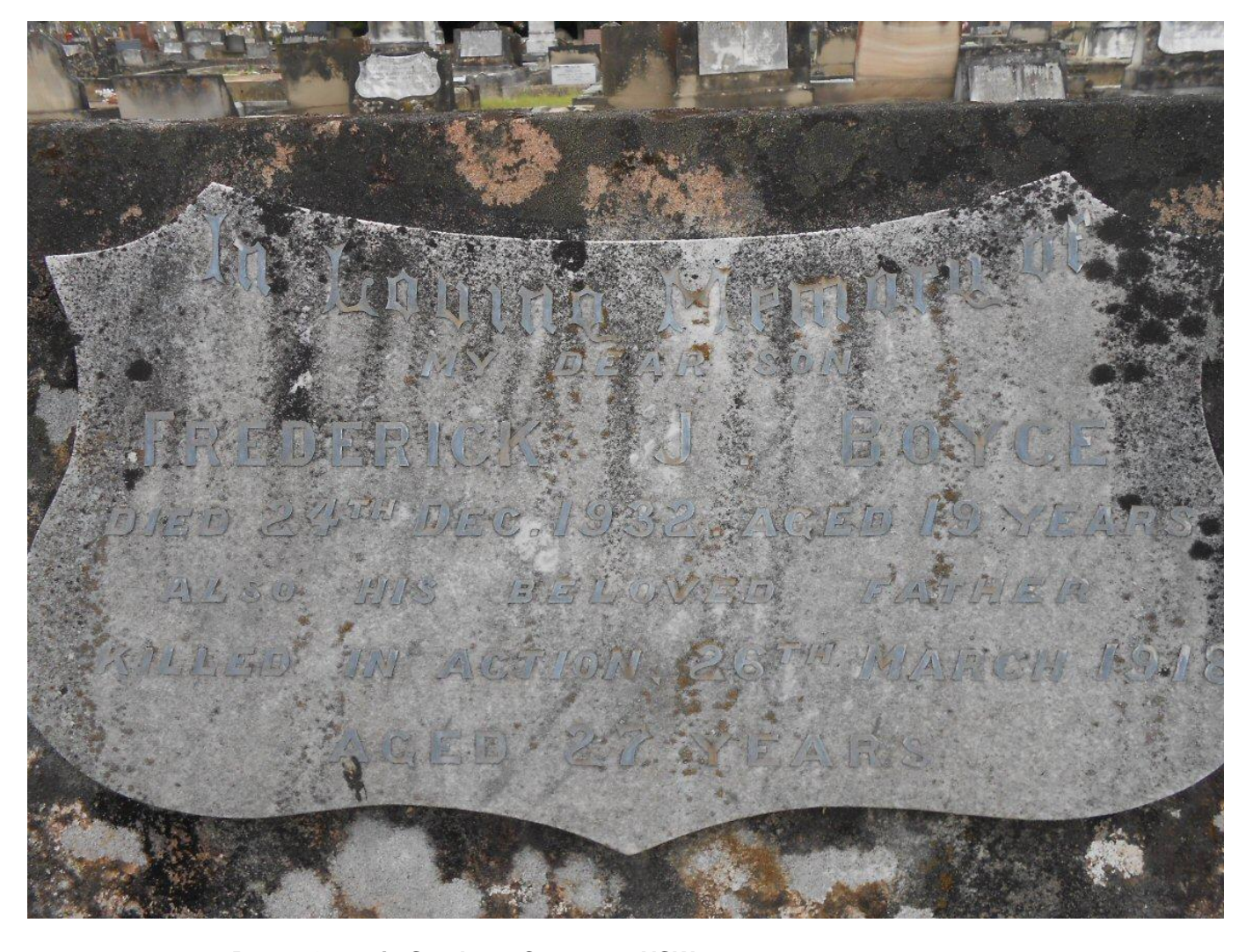
Boyce Grave in Sandgate Cemetery, NSW