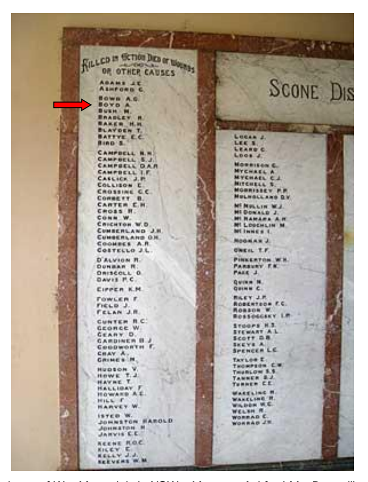
Scone and District Honour Roll