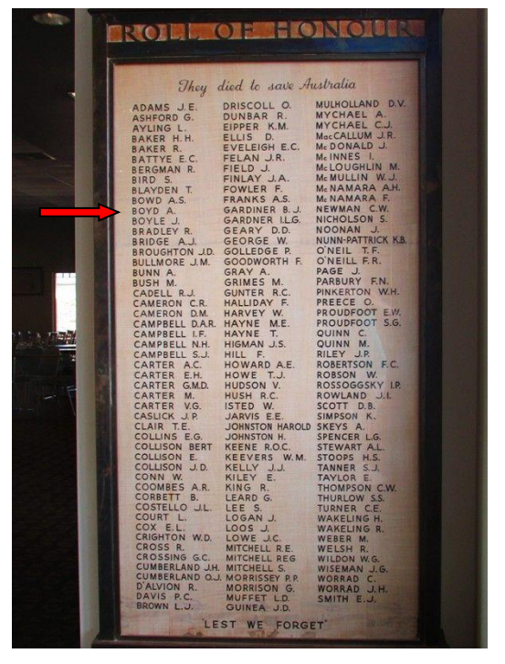
Scone RSL Club Roll of Honour