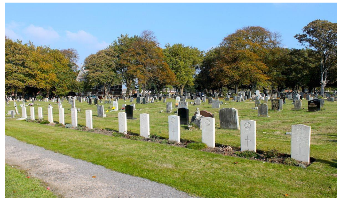
Australian War Graves in Milton Cemetery, Portsmouth