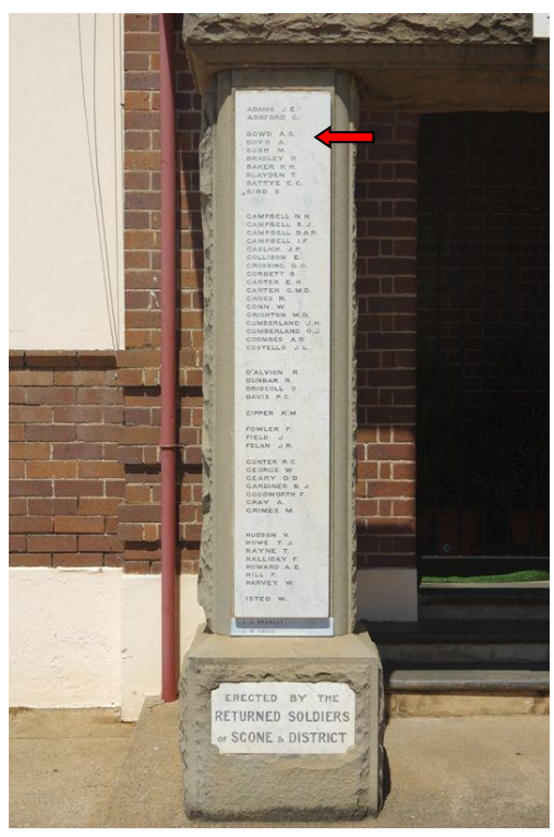
Scone Memorial Arch