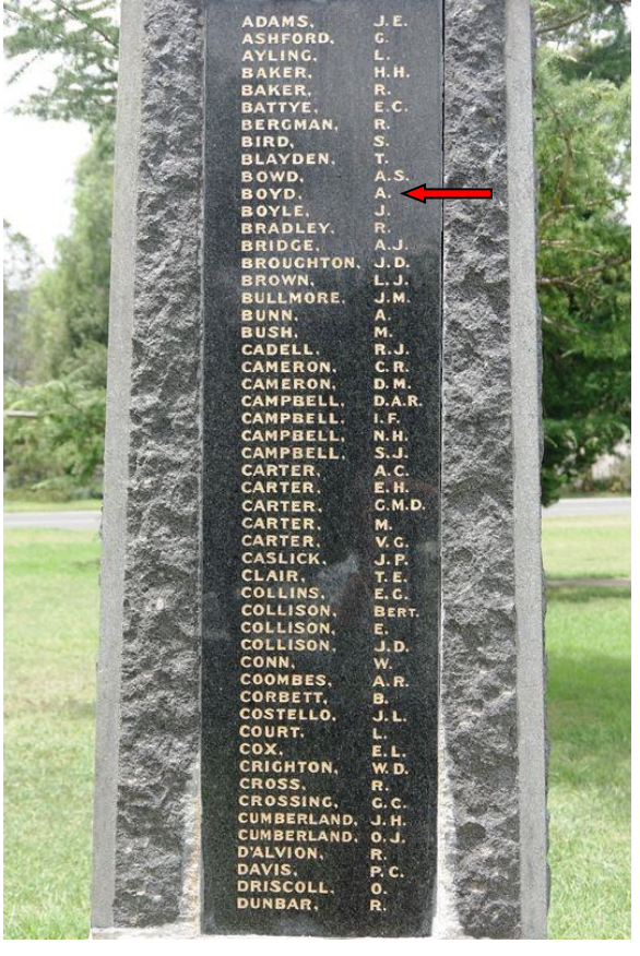
Scone War Memorial