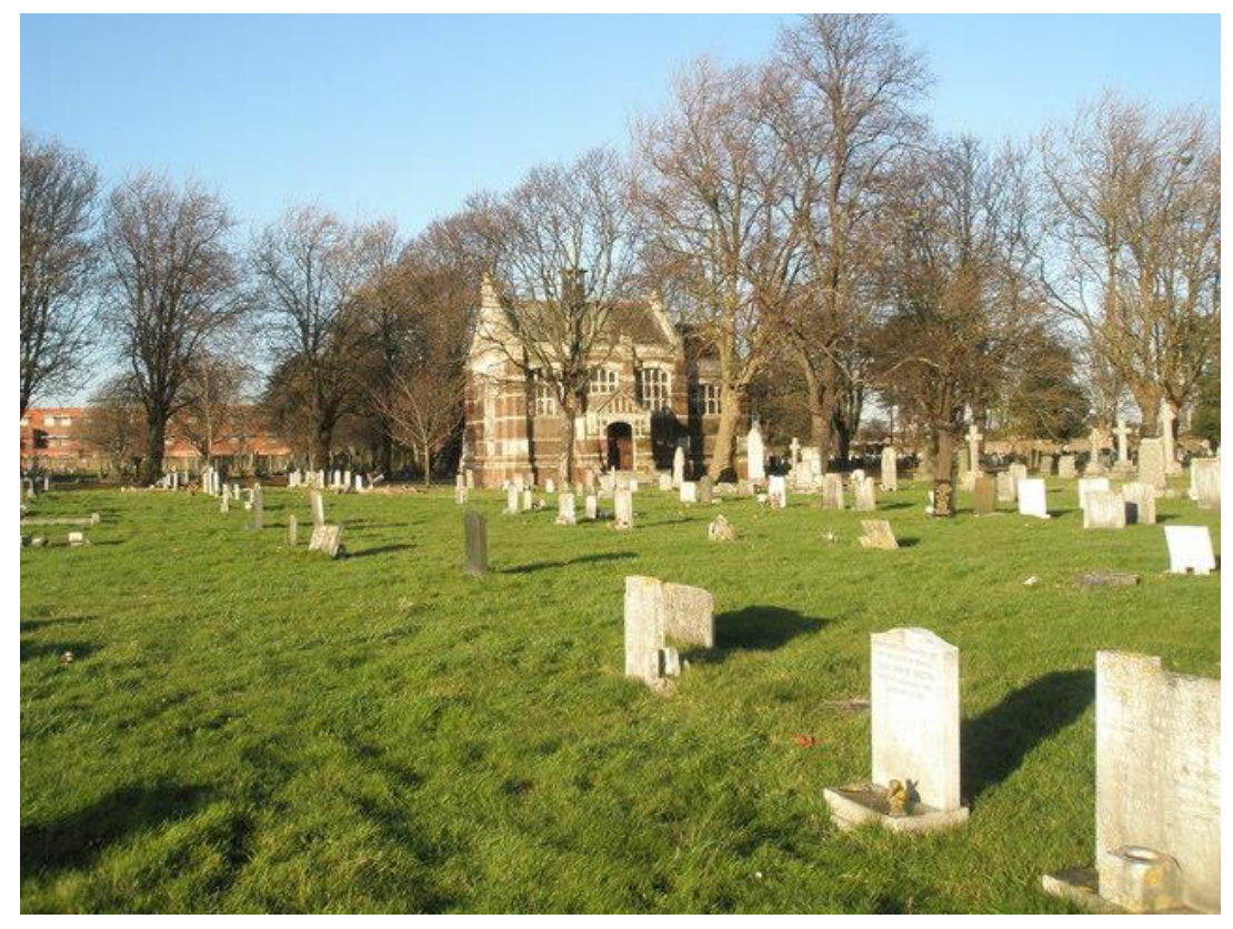
Cemetery Chapel at Milton Cemetery, Portsmouth