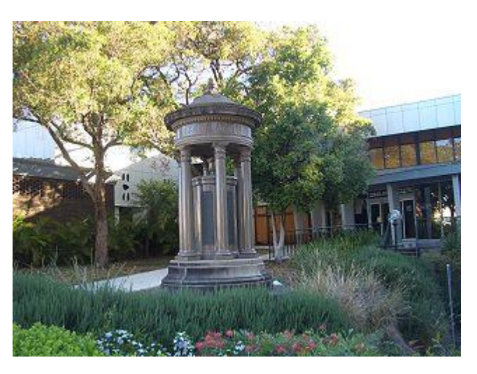
Drummoyne War Memorial