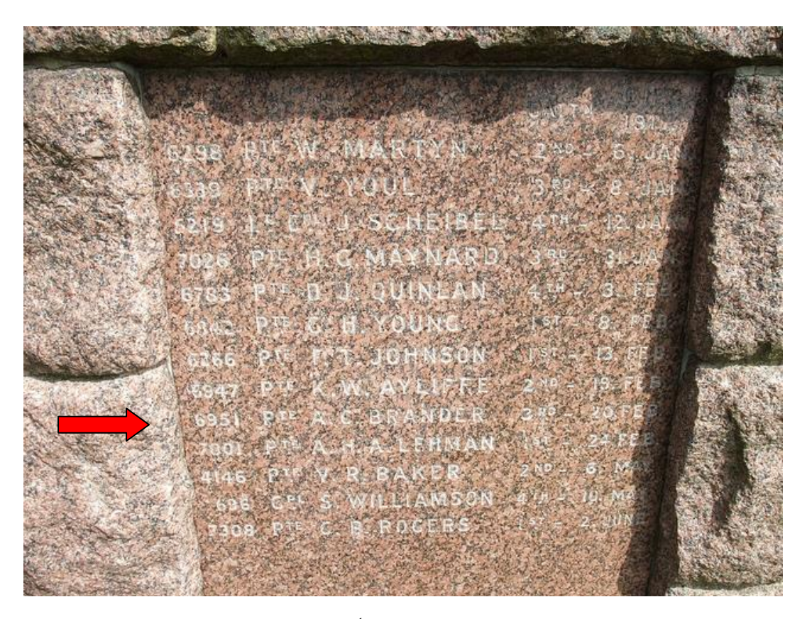
Memorial to 1<sup>st</sup> Training Battalion A.I.F. at Durrington Cemetery