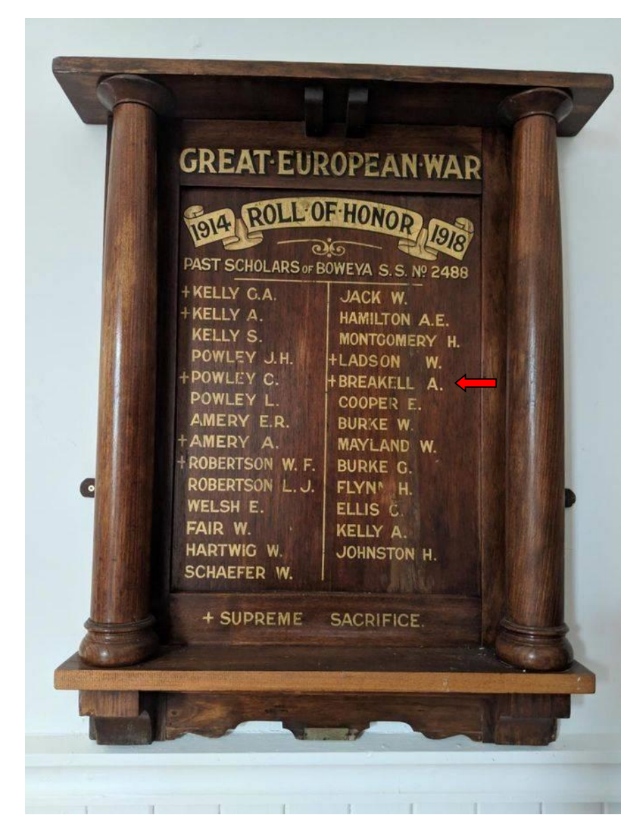
Boweya State School Honour Roll