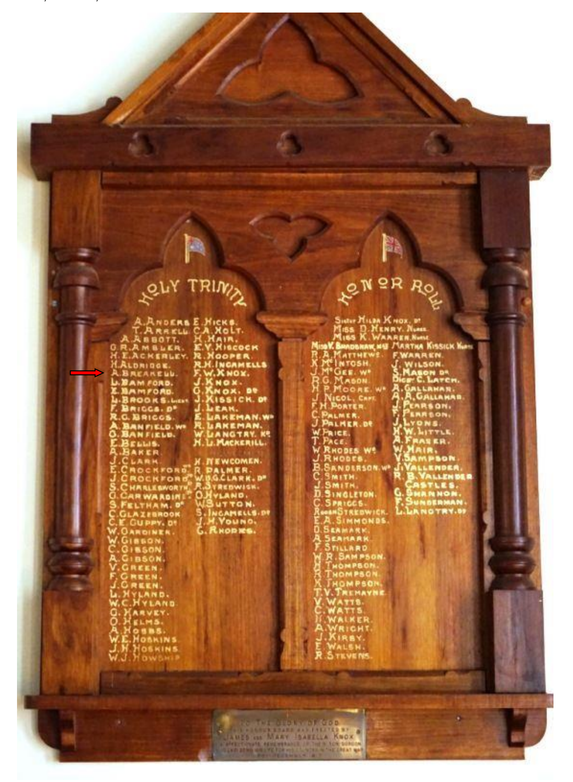
Benalla Holy Trinity Anglican Church Honour Roll

A. Breakell is remembered on the Holy Trinity Anglican Church Honour Roll, located in Holy Trinity Anglican Church, 73 Arundel Street, Benalla, Victoria.