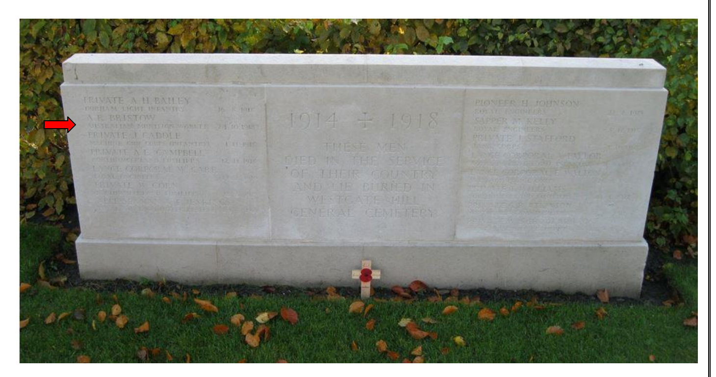
Screen Wall in West Road Cemetery, Newcastle-upon-Tyne commemorating those from WW1 buried in Westgate Hill General Cemetery, Newcastle Upon Tyne, Northumberland, England