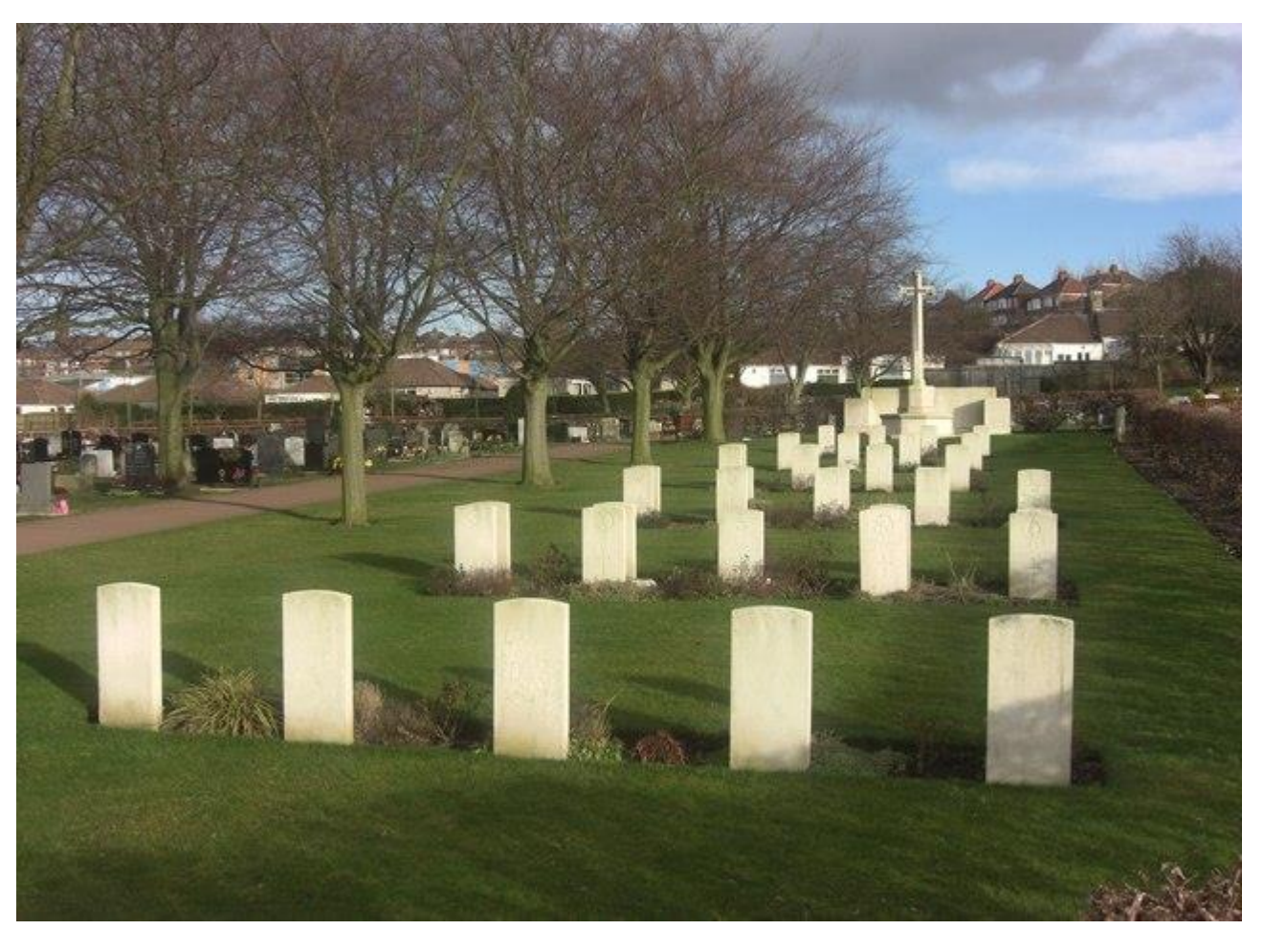
West Road Cemetery - Commonwealth War Graves

The WWII military plot commemorates not only those buried as shown in the photo but also those cremated in the nearby crematorium, and also those from WWI buried in Westgate Hill Cemetery