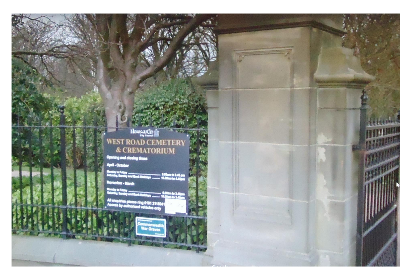
Entrance to West Road Cemetery, Newcastle-on-Tyne