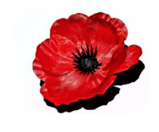
Lest We Forget