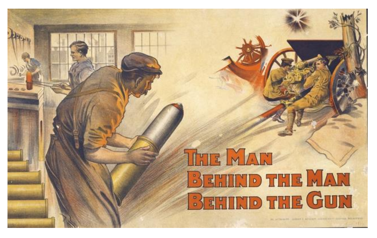
** Note – 46 pages of the Munitions Worker Record file for Aubrey Rhys Bristow, Australian Munition Worker No.3487 is open for viewing online at National Archives Australia

These men were not members of the Australian Imperial Forces and did not serve in combat units, but were recruited to meet the shortfall in skilled labour that threatened many of Britain's key wartime industries including munitions. (Source: Australian War Memorial)