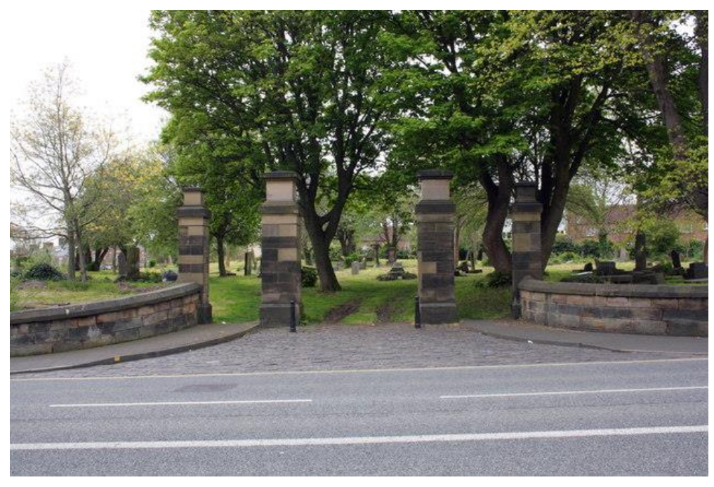
Entrance to Westgate Hill Cemetery from Westgate Road

Westgate Hill General Cemetery, Newcastle Upon Tyne contains 15 Commonwealth War Graves – all from World War 1.