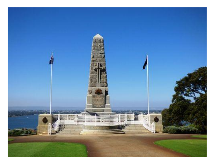
Western Australia State War Memorial Cenotaph, Kings Park

The heavy concrete foundations are supplemented by heavy brick walls which enclose an inner chamber or crypt. The walls surrounding the crypt are covered with The Roll of Honour; marble tablets which list under their units the names of more than 7,000 members of the services killed in action or as a result of World War One.