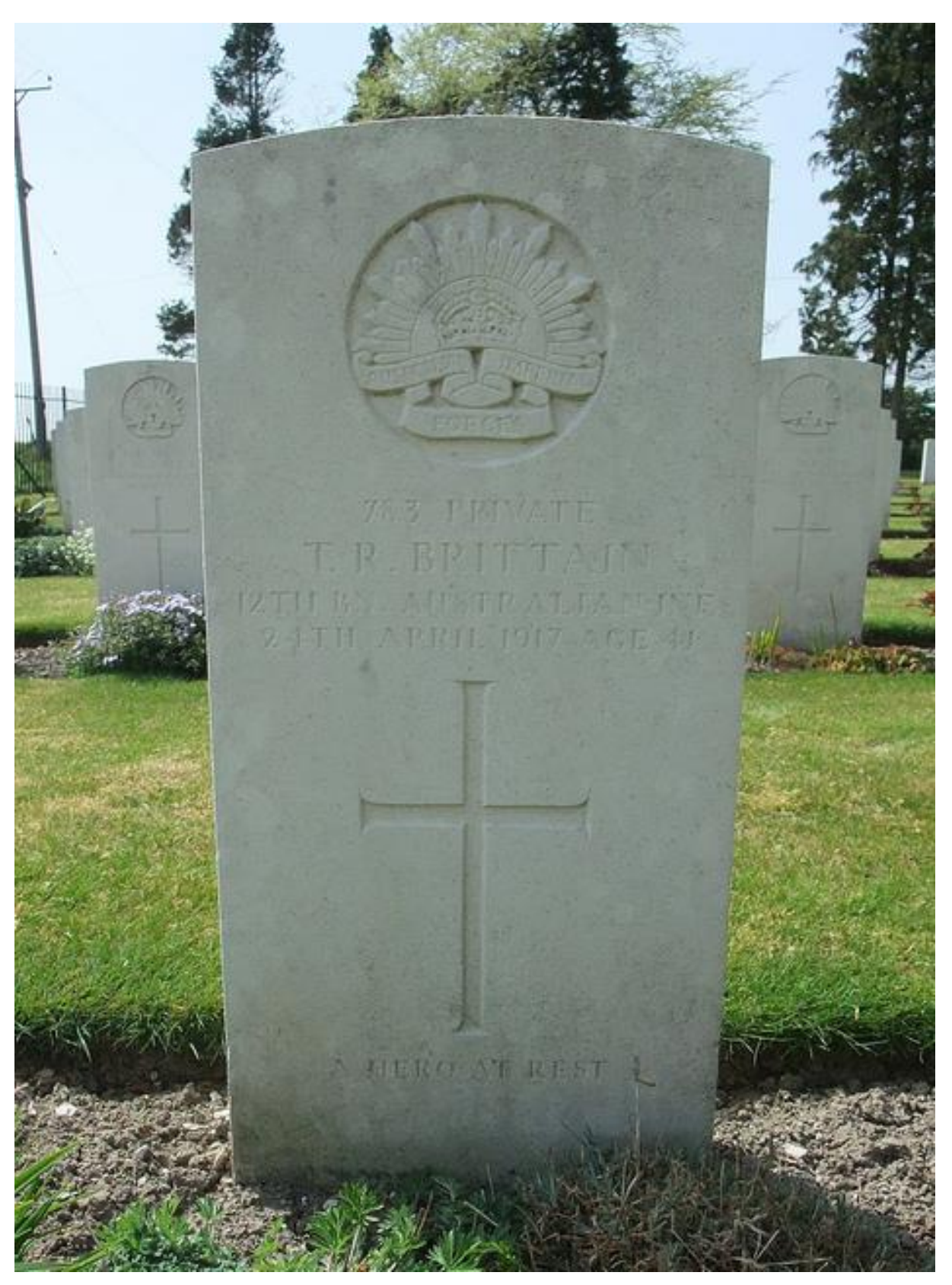
Photo of Private T. R. Brittain's Commonwealth War Graves Commission Headstone at Durrington Cemetery, Wiltshire, England.