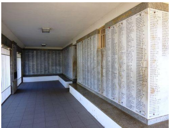
State War Memorial Cenotaph, King's Park, Western Australia