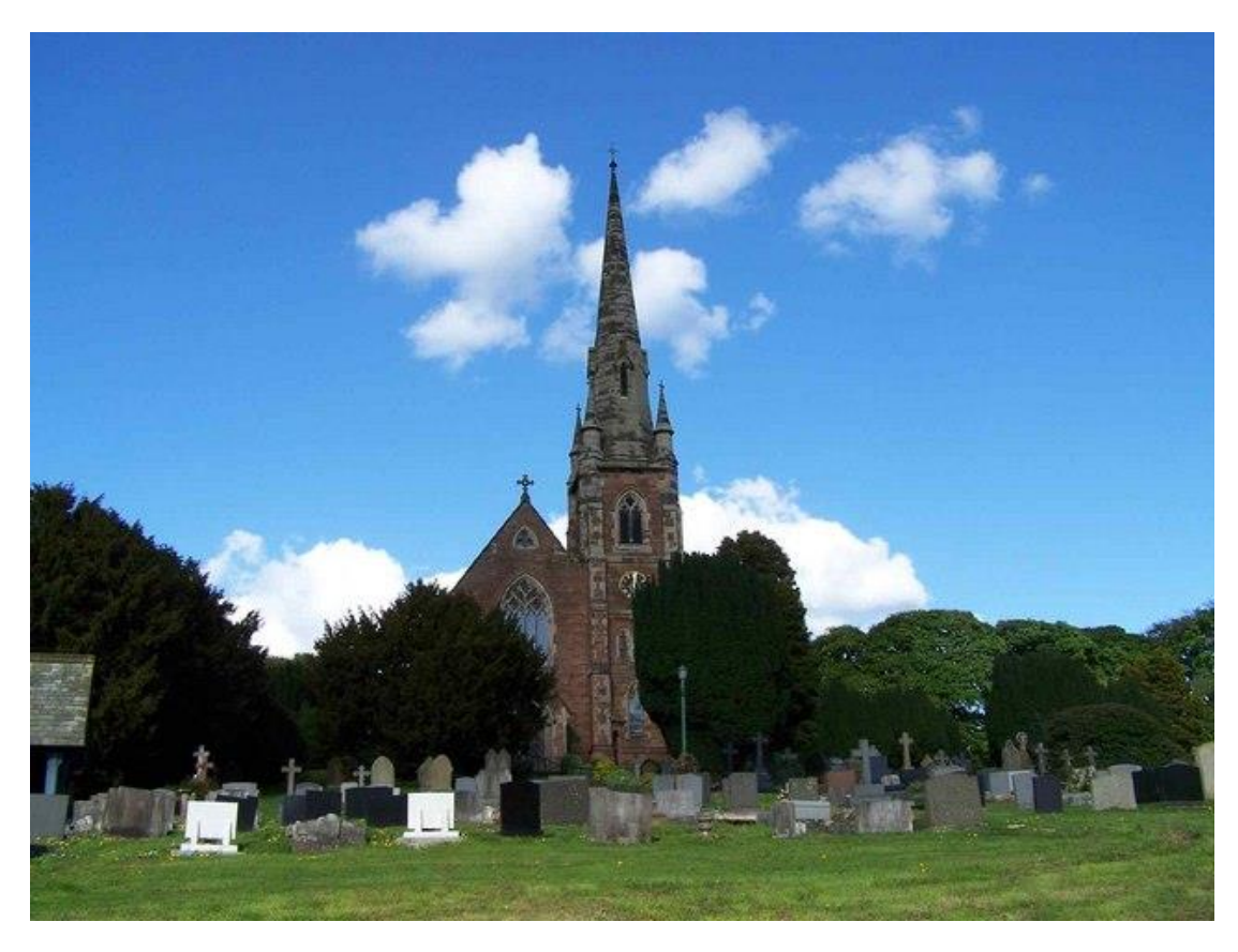
St. John the Baptist Church, Keele, Staffordshire

St. John the Baptist Churchyard, Keele, Staffordshire contains only two War Graves, both relating to World War 1 – the other death occurred in 1919.