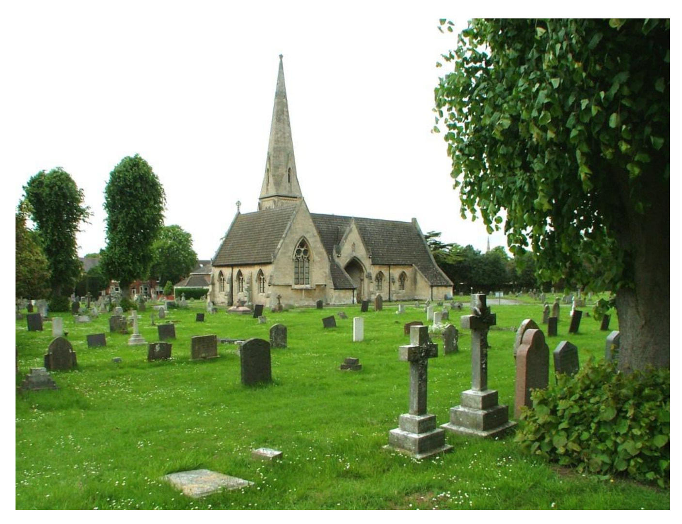
Grantham Cemetery