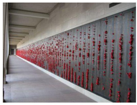
Roll Of Honour WW1 Australian War Memorial Canberra, Australia

Private A. Bruni is commemorated on the Roll of Honour, located in the Hall of Memory Commemorative Area at the Australian War Memorial, Canberra, Australia on Panel 52.