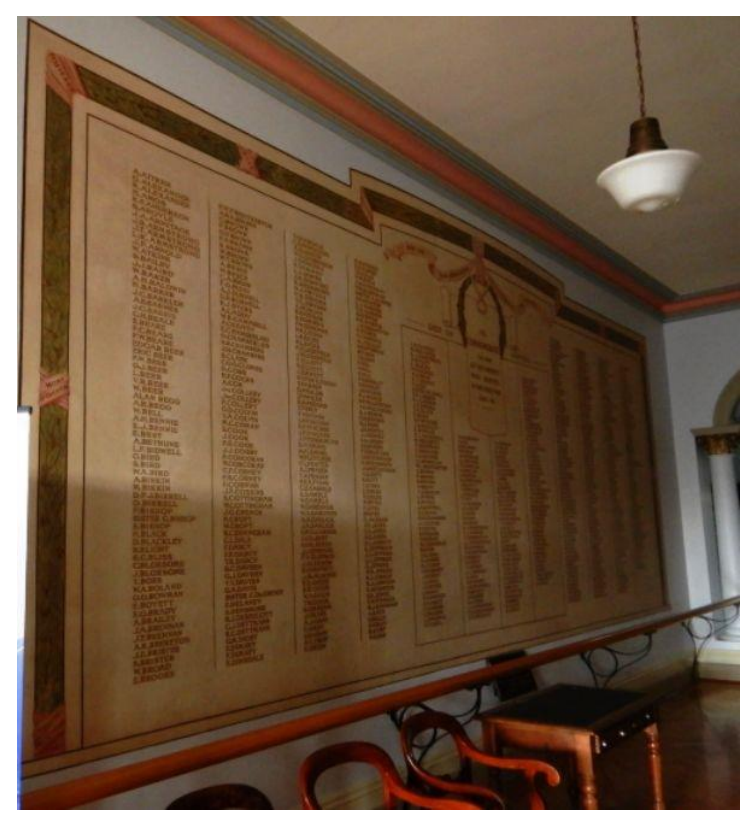
Kyneton Honour Roll