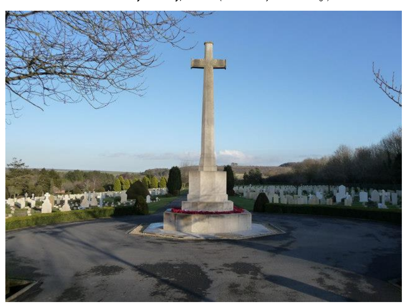
Tidworth Military Cemetery, Wiltshire