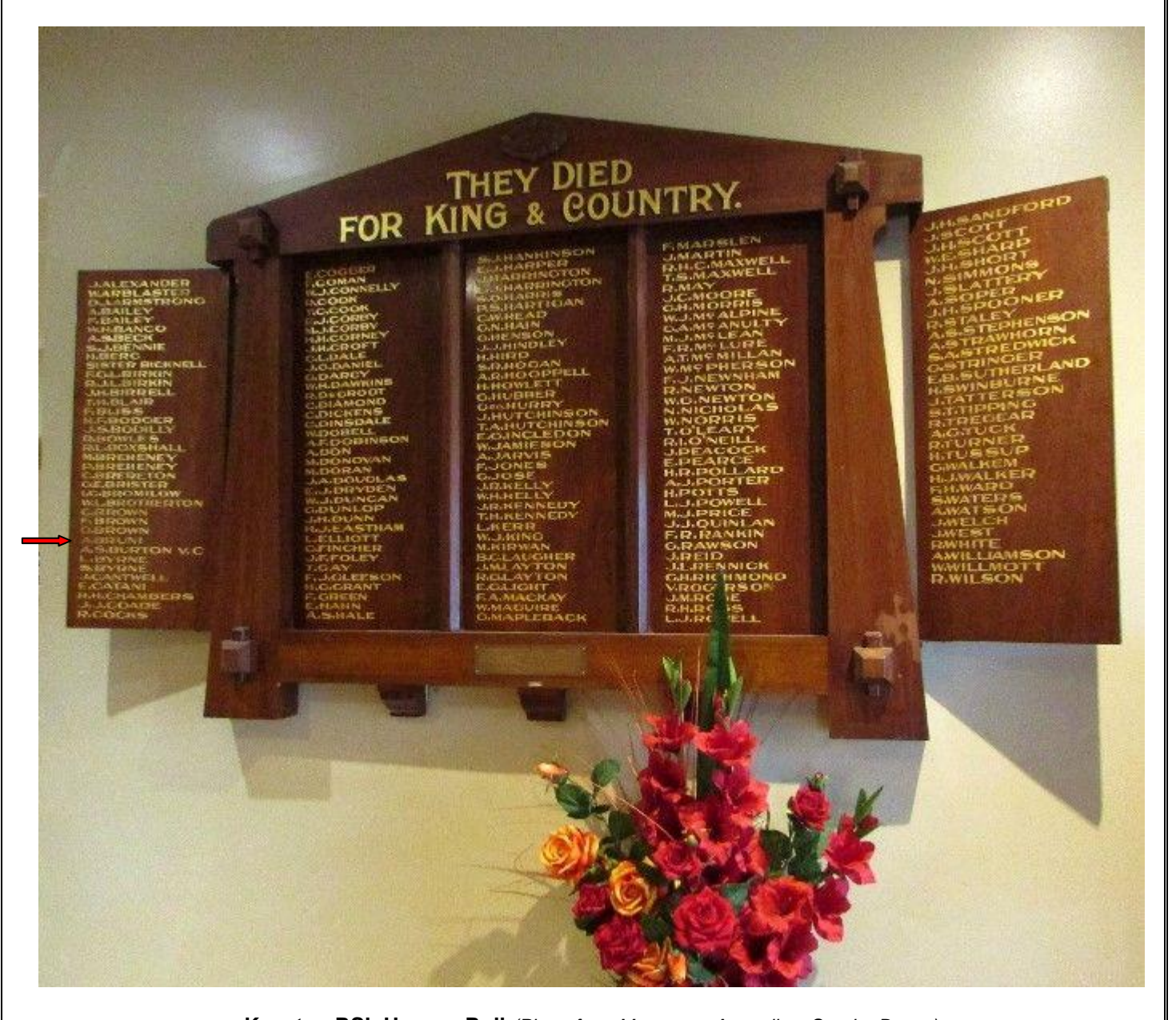
Kyneton RSL Honour Roll