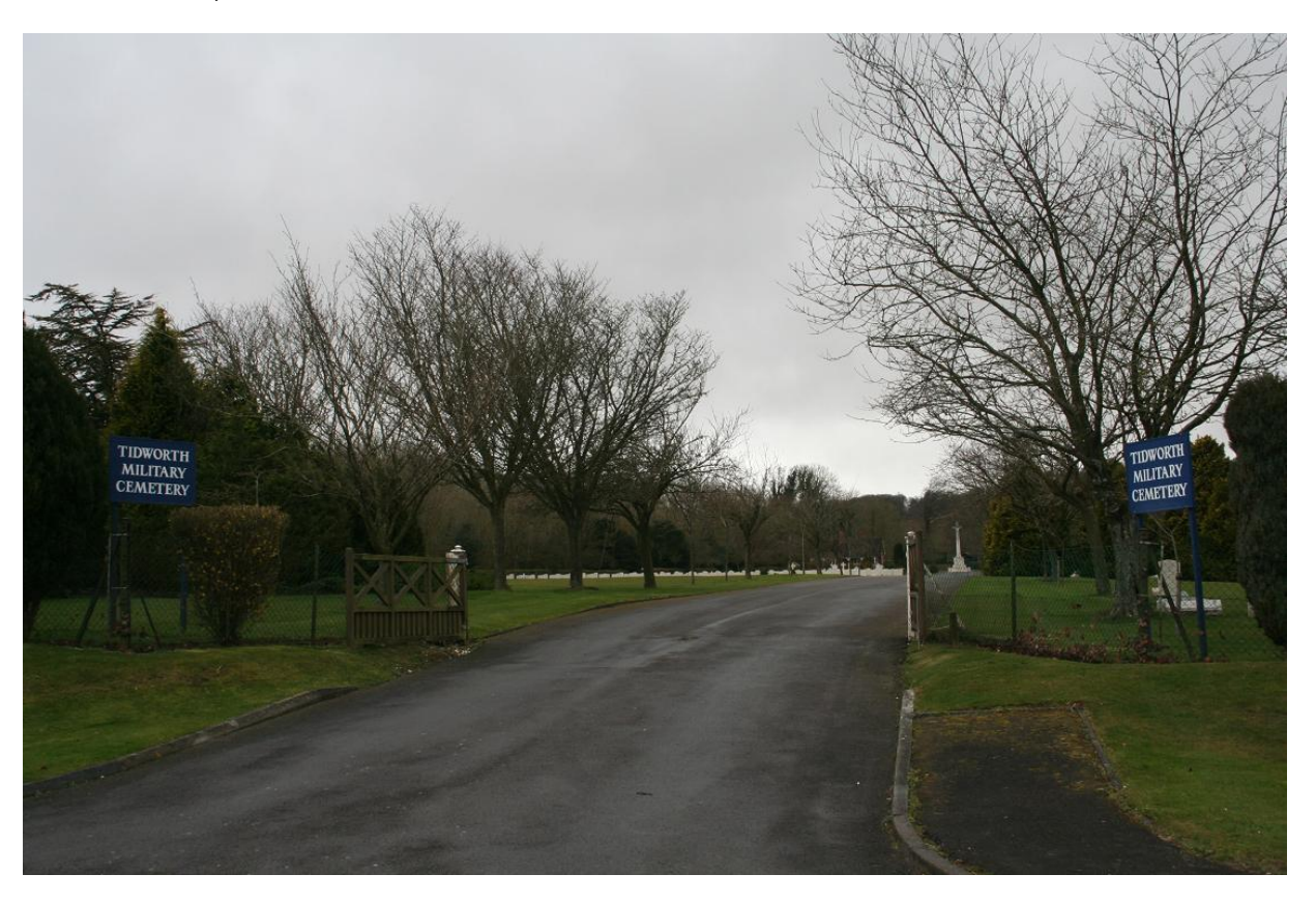
Tidworth Military Cemetery