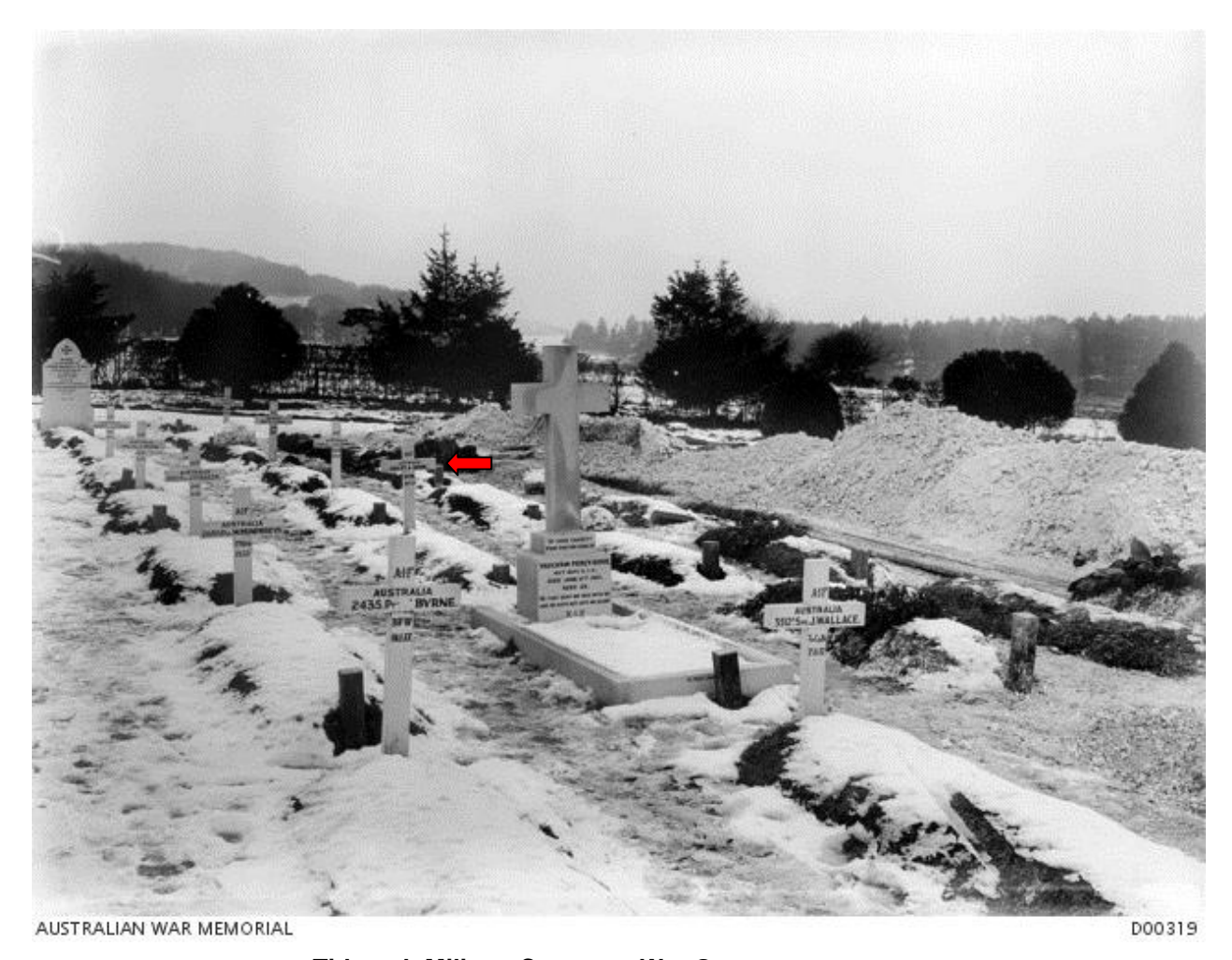
Tidworth Military Cemetery War Graves – March 1919

Snow cover on graves marked with a cross in the AIF cemetery.