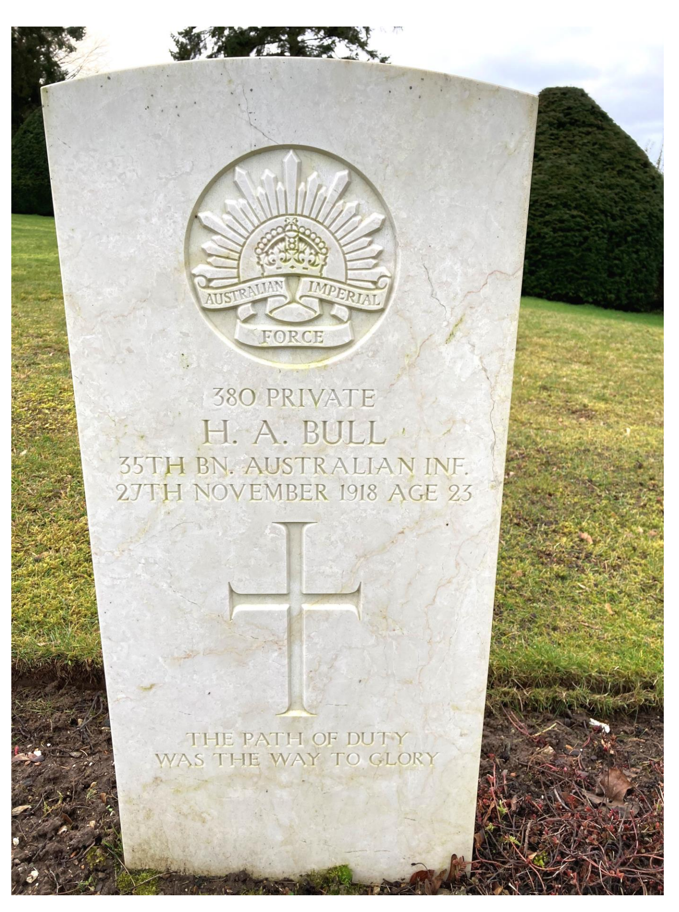
Photo of Private H. A. Bull's Commonwealth War Graves Commission Headstone in Tidworth Military Cemetery, Wiltshire, England