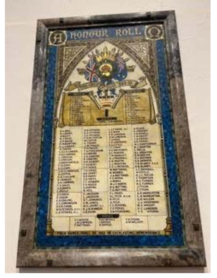
Caulfield Anglican Church Roll of Honour