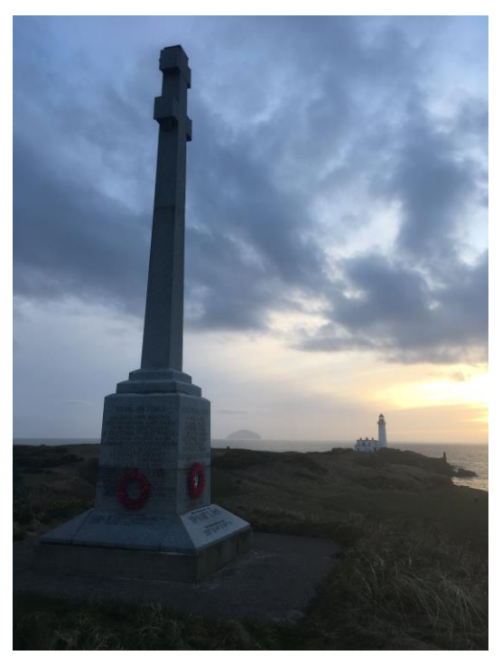
Turnberry School of Aerial Gunnery & Fighting Memorial