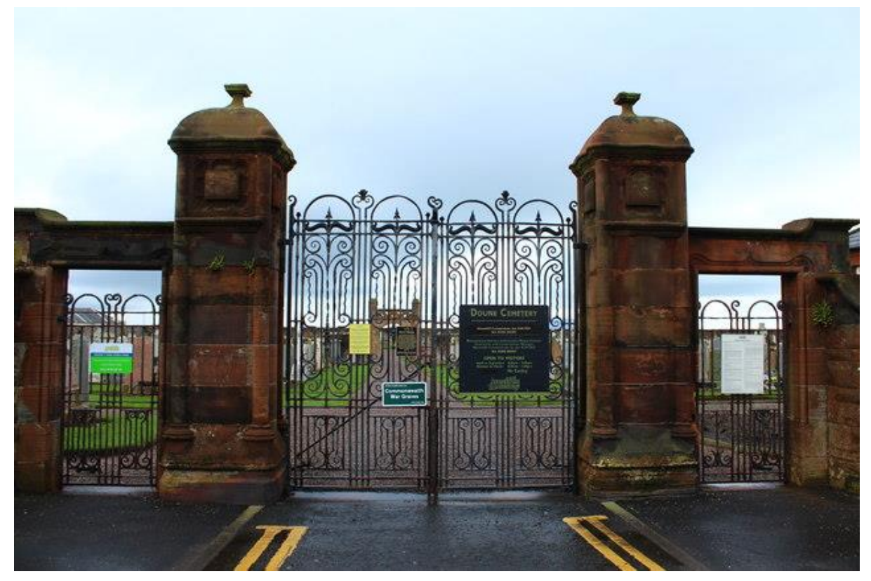
Doune Cemetery, Girvan, Ayrshire, Scotland

Doune Cemetery, Girvan contains twenty one (21) Commonwealth burials of World War 1 and twenty (20) from World War 2, two of which are unidentified. There are also four Foreign National burials.