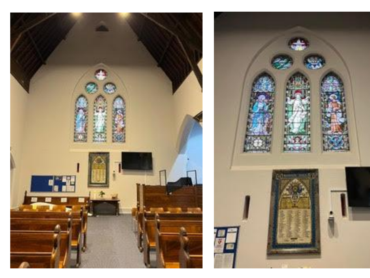
Caulfield Anglican Church Roll of Honour