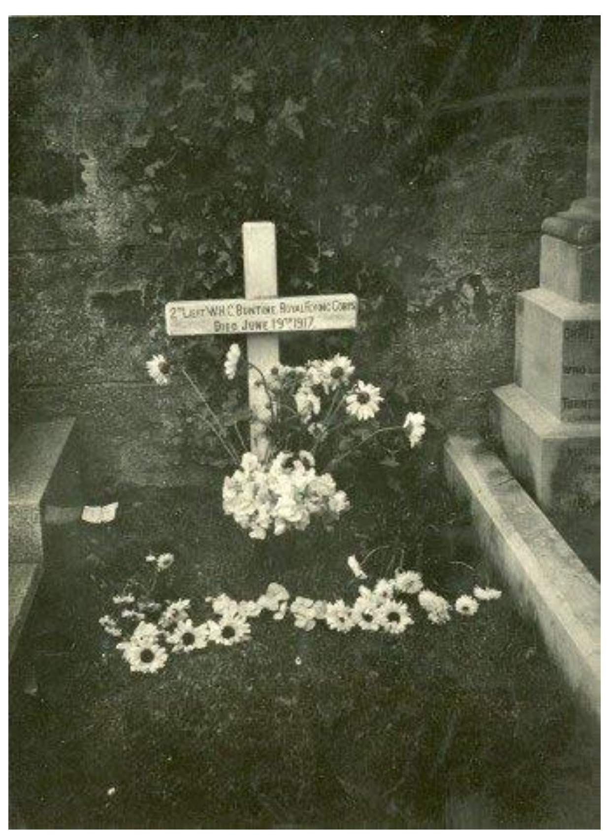
Second Lieutenant Walter Horace Carlyle Buntine's original Cross marking his grave in Doune Cemetery, Girvan.