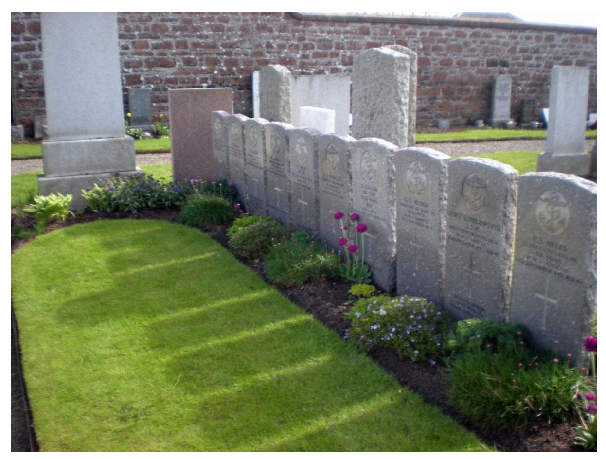
Doune Cemetery, Girvan, Ayrshire, Scotland