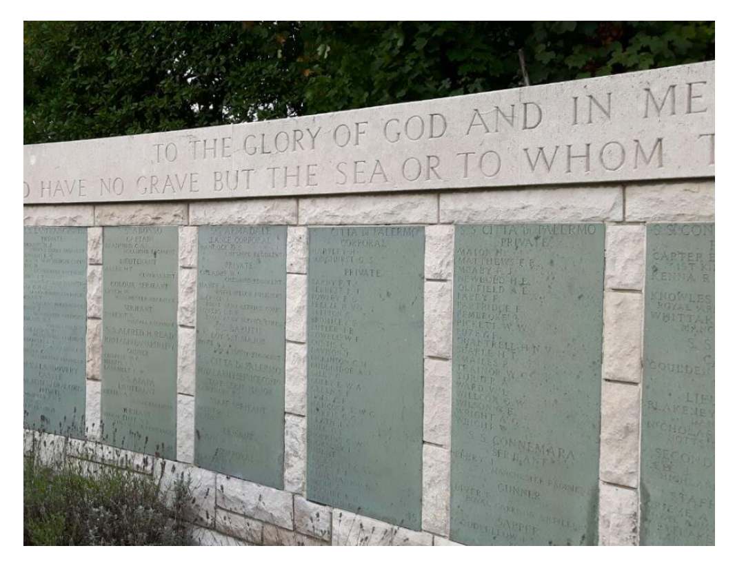
Name Panels behind Cross of Sacrifice