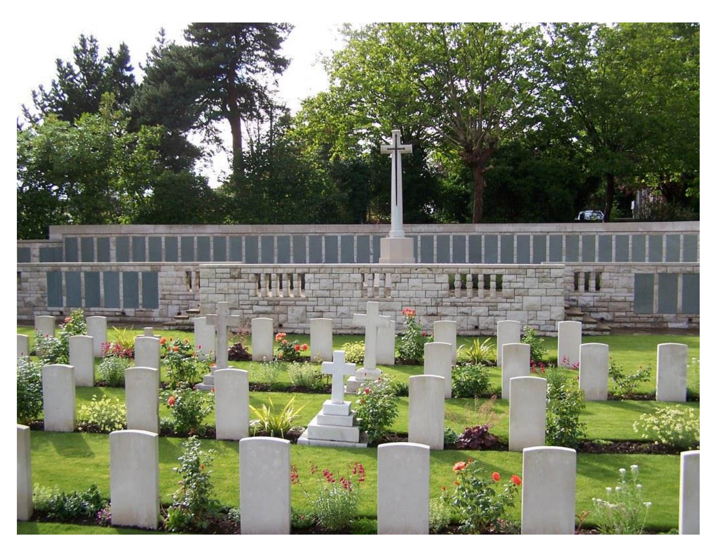
CWGC Graves in Hollybrook Cemetery with Cross of Sacrifice & Hollybrook Memorial