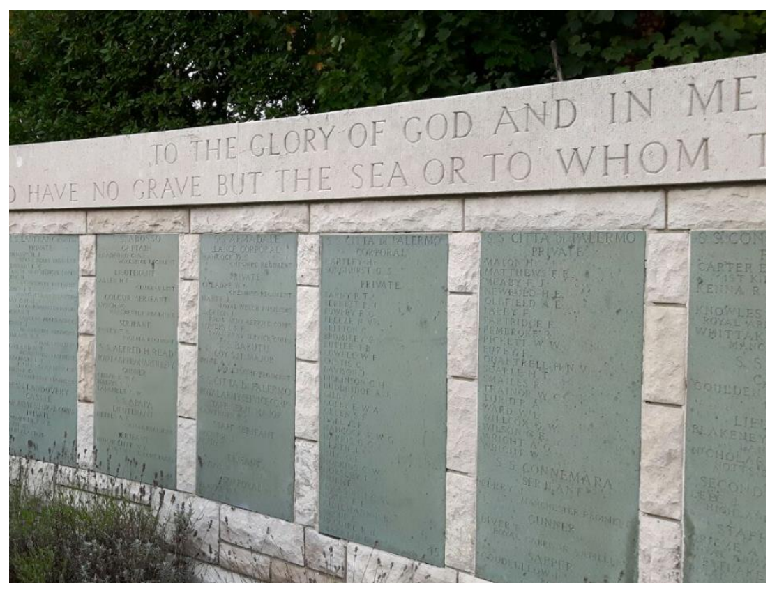
Name Panels behind Cross of Sacrifice