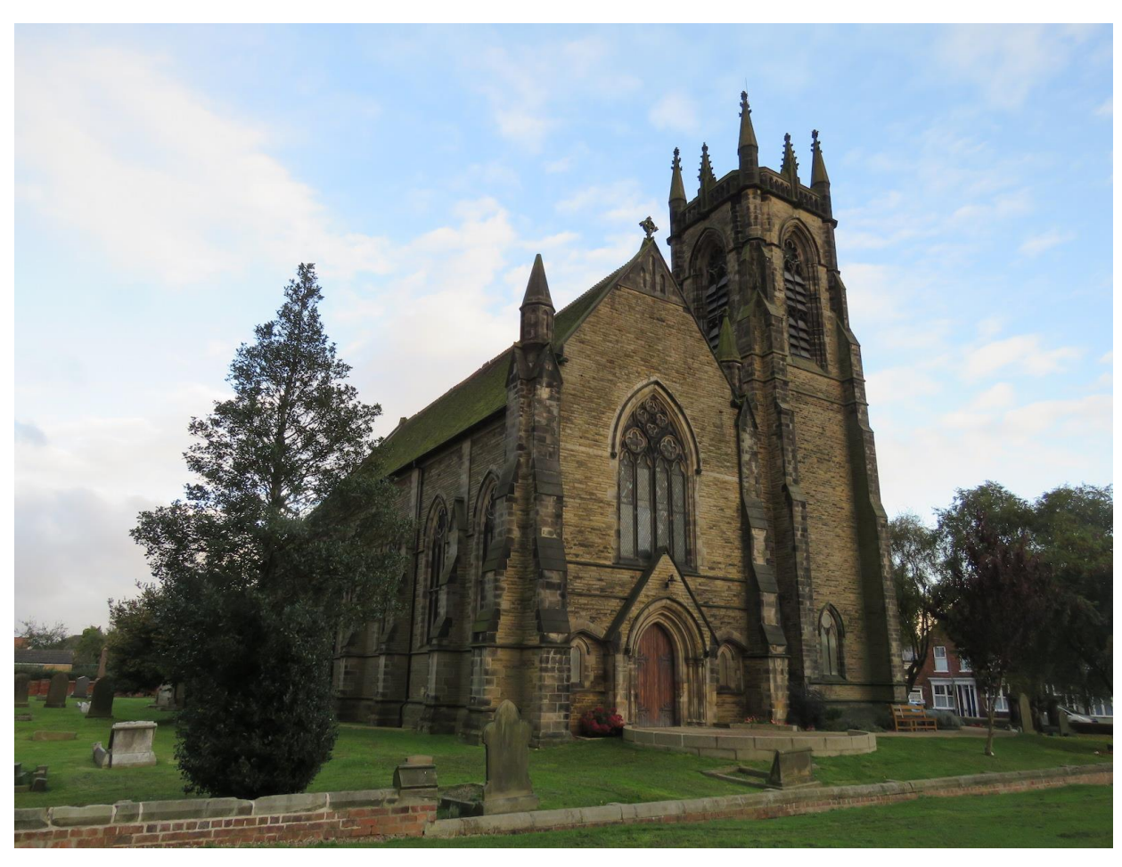
St. Nicholas Church, Beverley