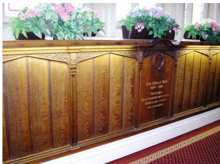
Eastbourne War Memorial, Sussex