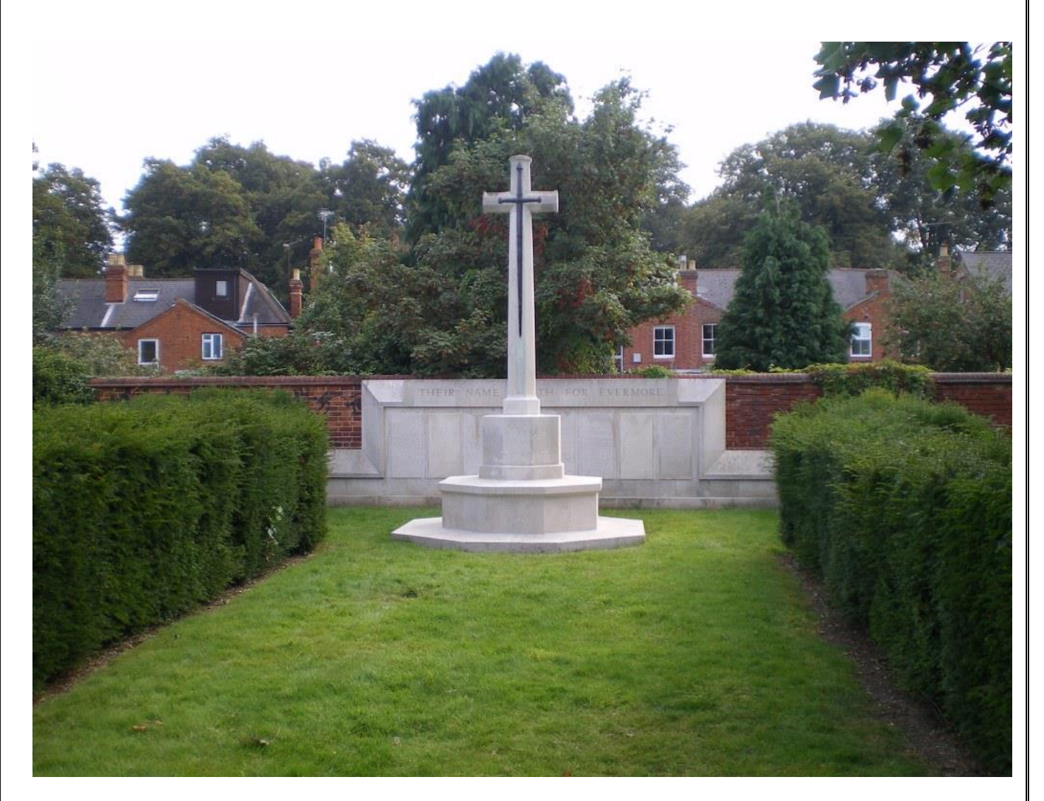
Cross of Sacrifice & Memorial Screen Wall, Reading Cemetery, Reading, Berkshire