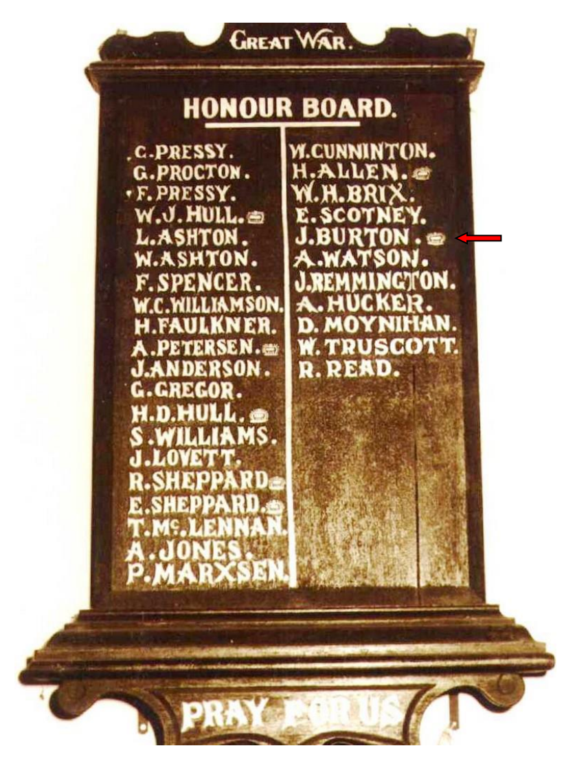
Tegege Hall Honour Board