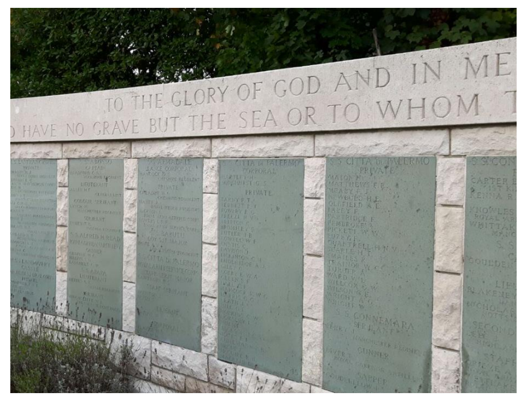
Name Panels behind Cross of Sacrifice