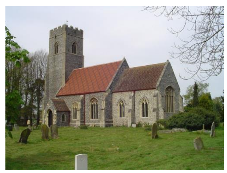
St. Bartholomew Churchyard, Ingham, Surrey

St. Bartholomew Churchyard, Ingham contains 10 War Graves, all but one being World War 1 graves. There are 2 Australian Soldiers buried in this Churchyard.