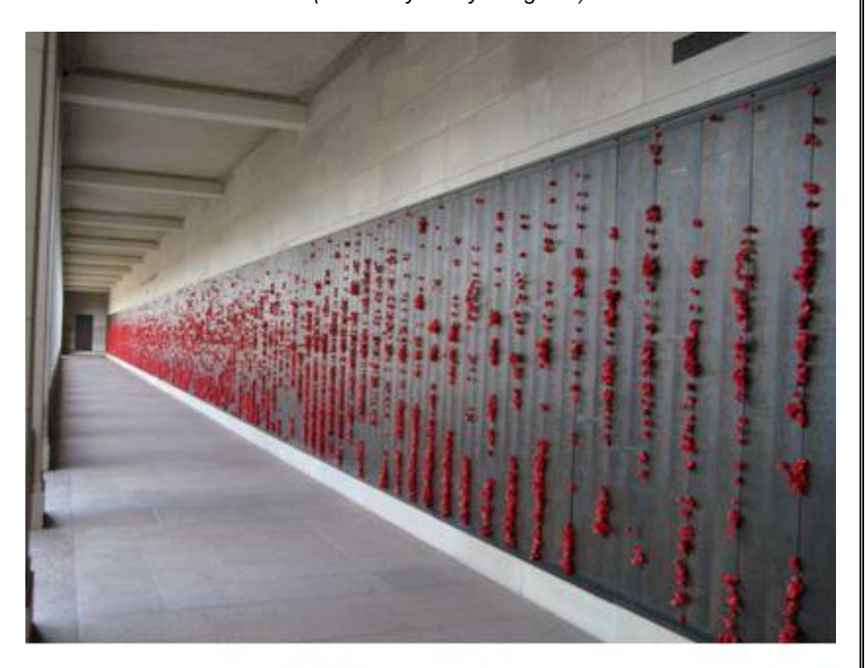
Roll Of Honour WW1 Australian War Memorial Canberra, Australia