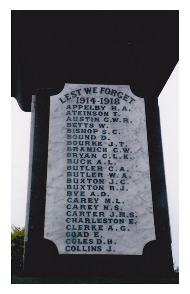
Sheffield War Memorial