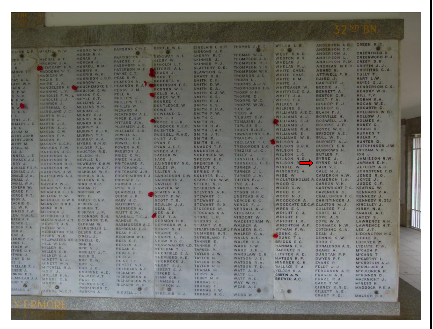
32nd Battalion Panel

Private M. E. Byrne is commemorated on the Roll of Honour, located in the Hall of Memory Commemorative Area at the Australian War Memorial, Canberra, Australia on Panel 120.