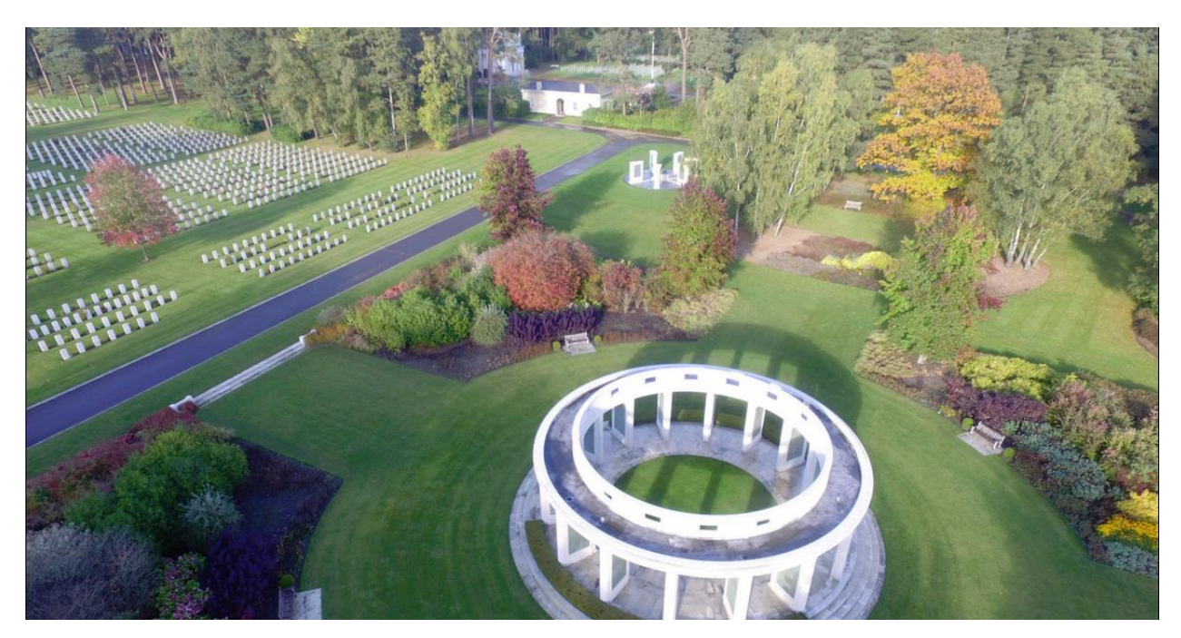
Brookwood Military Cemetery

There are 446 Australian War Graves in Brookwood Military Cemetery – 351 from World War 1 & 95 from World War 2.