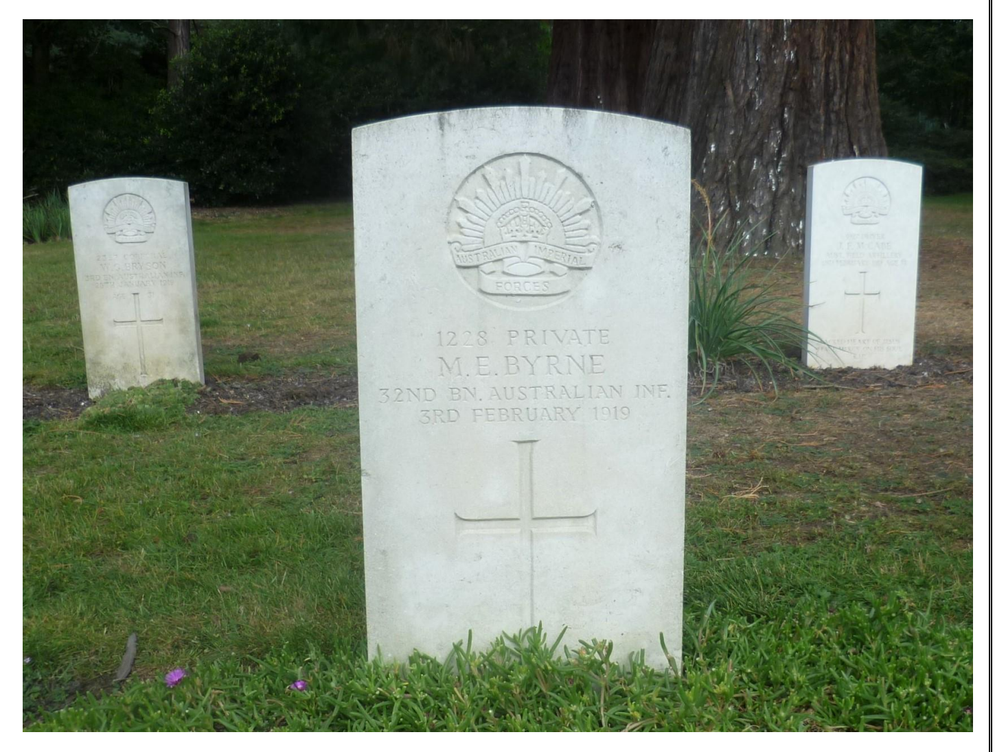
Photo of Private M. E. Byrne's Commonwealth War Graves Commission Headstone in Brookwood Military Cemetery, Surrey, England.