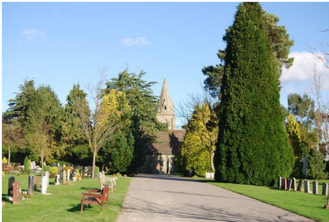
Tunbridge Wells Cemetery

Tunbridge Wells Cemetery contains 138 Commonwealth War Graves – 75 relate to World War 1 which are scattered throughout the Cemetery & 63 relate to World War 2, of which more than half are located in a war graves plot in the south-eastern part of the Cemetery.