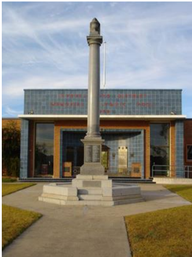
Inverell War Memorial