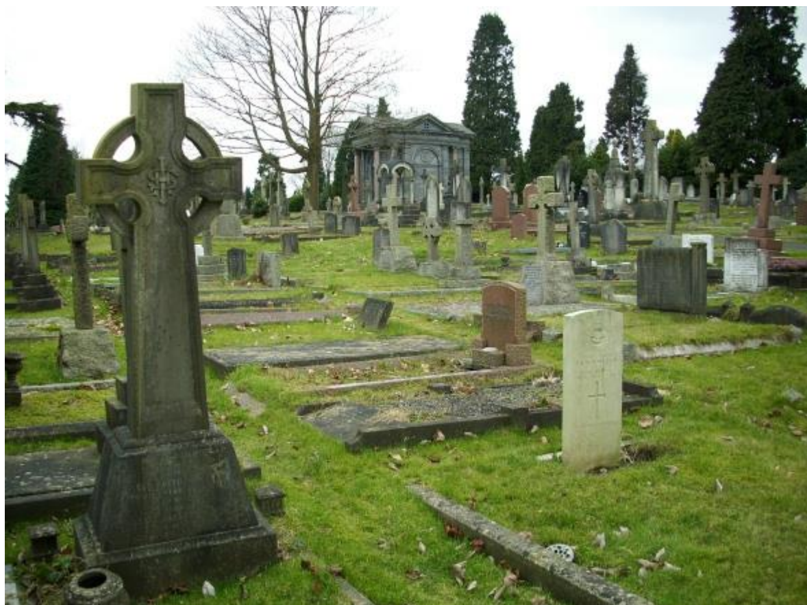
Tunbridge Wells Cemetery