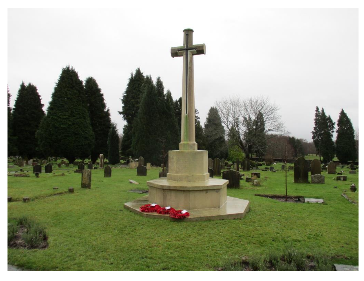
Tunbridge Wells Cemetery