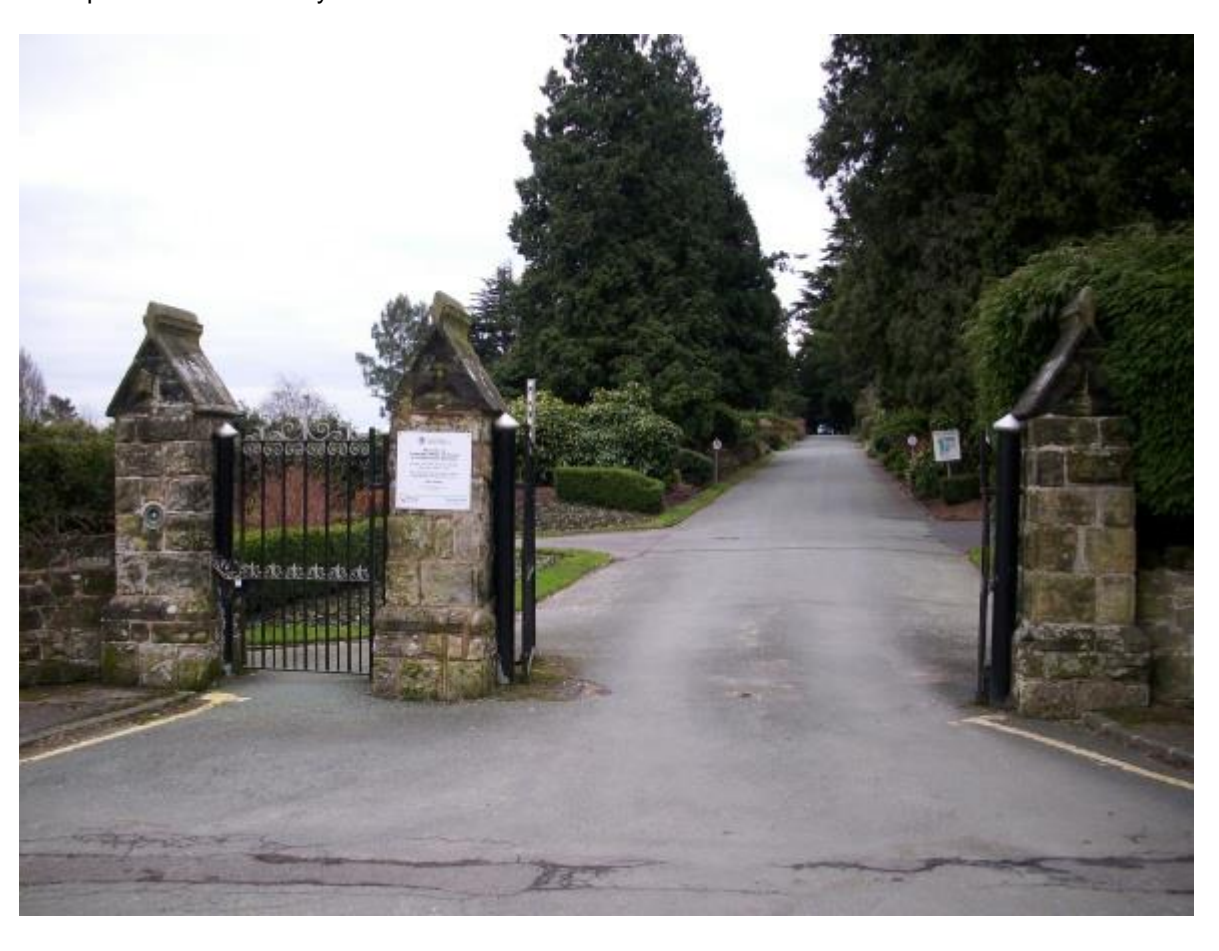
Tunbridge Wells Cemetery

Tunbridge Wells Cemetery contains 138 Commonwealth War Graves – 75 relate to World War 1 which are scattered throughout the Cemetery & 63 relate to World War 2, of which more than half are located in a war graves plot in the south-eastern part of the Cemetery.