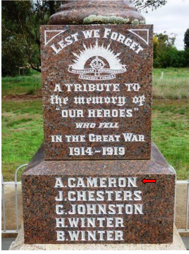
Lake Rowan War Memorial