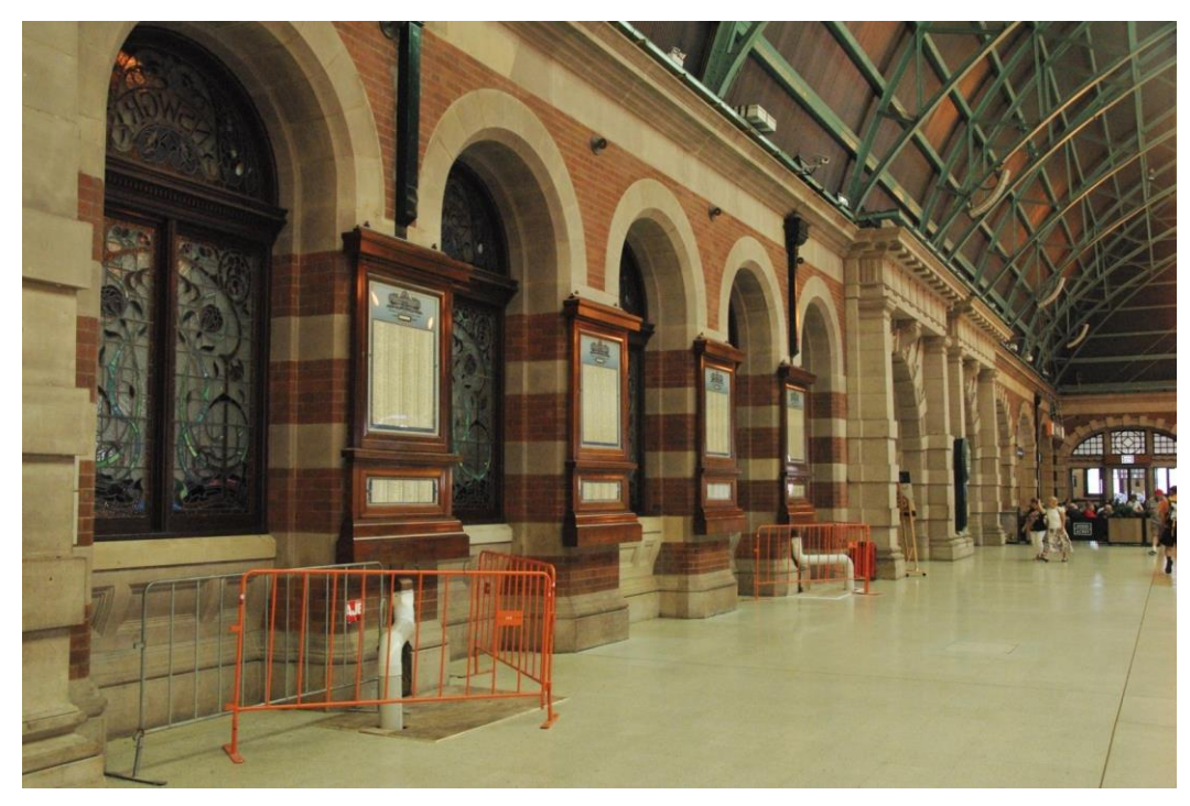
NSW Government Railways & Tramways Roll of Honour