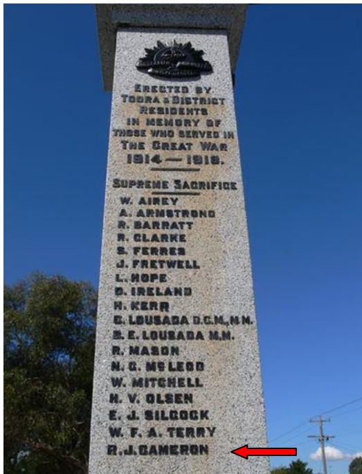
Toora War Memorial