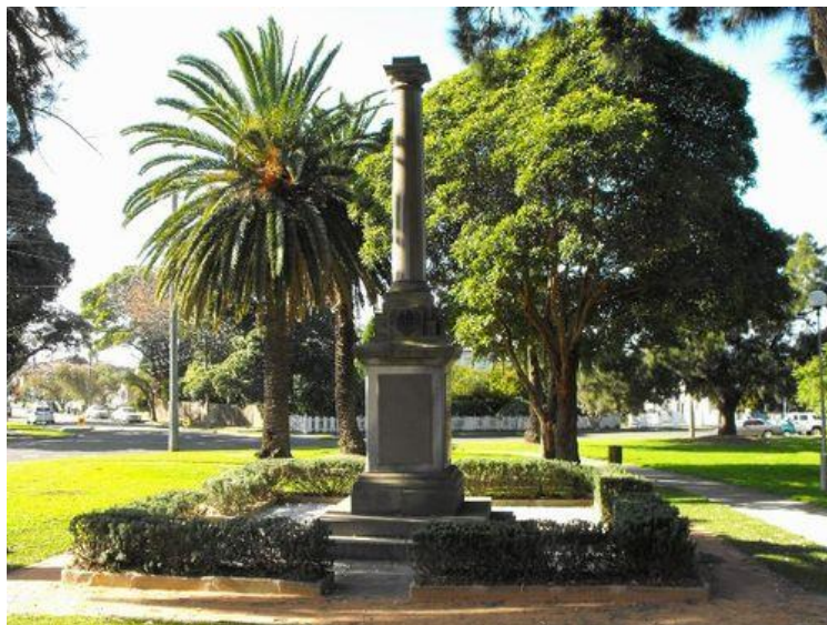
Kogarah War Memorial

The Kogarah War Memorial, which was erected in 1923, does not have any names inscribed on it. It was intended however, that names would be added to the four panels of the memorial but this did not eventuate.