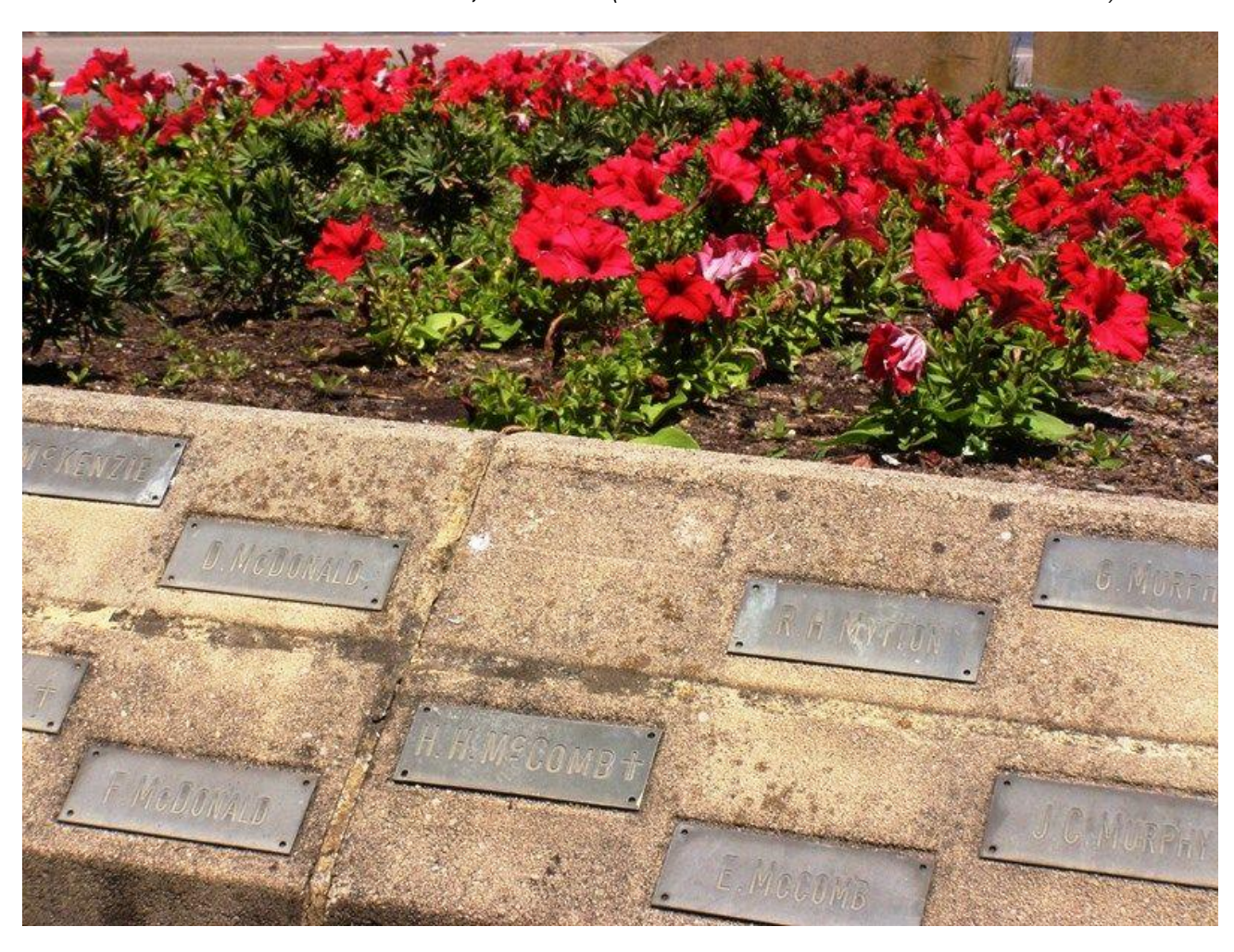
(Named plaques on garden border)