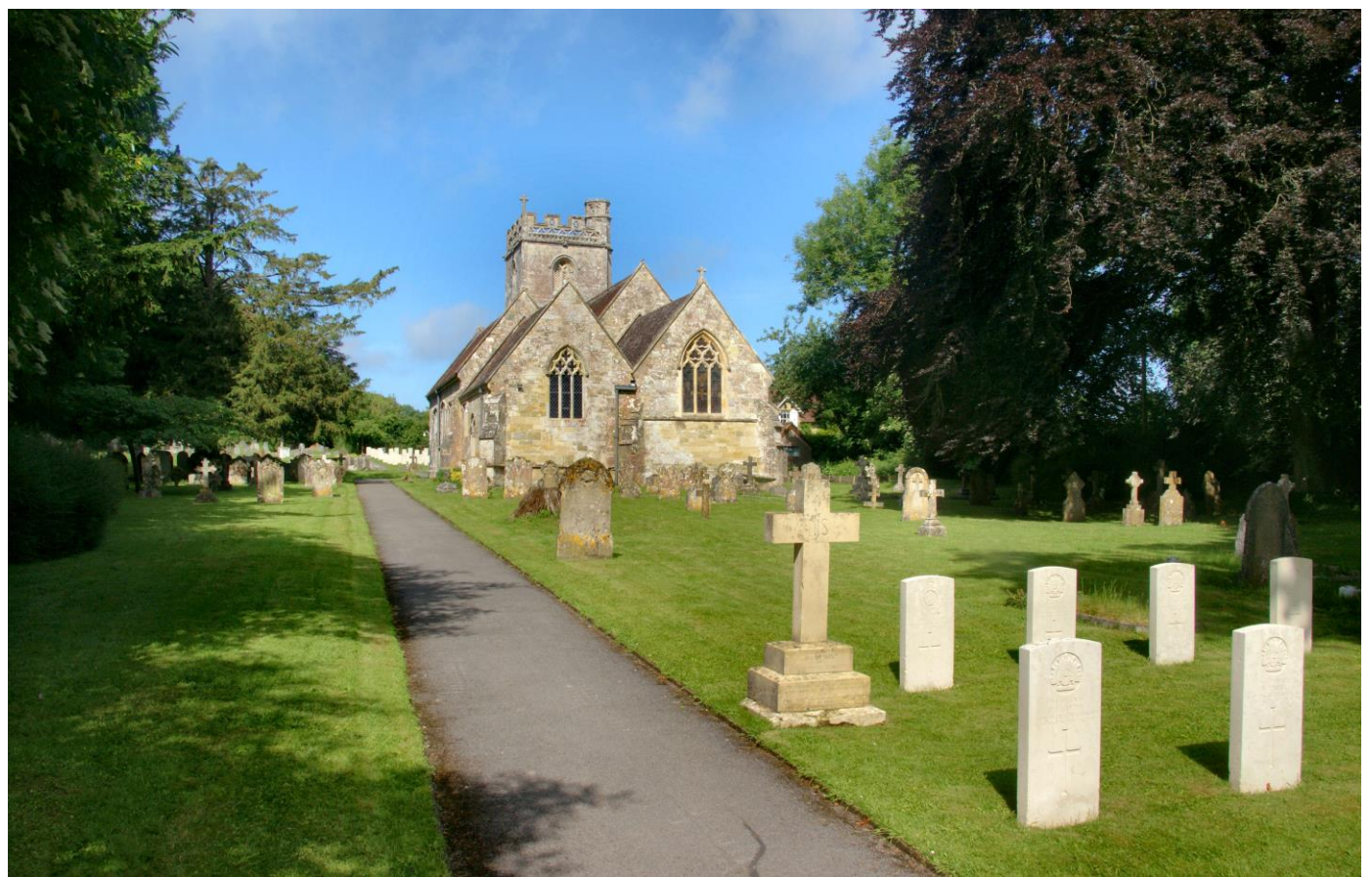
St George's Churchyard, Fovant – War Graves at front