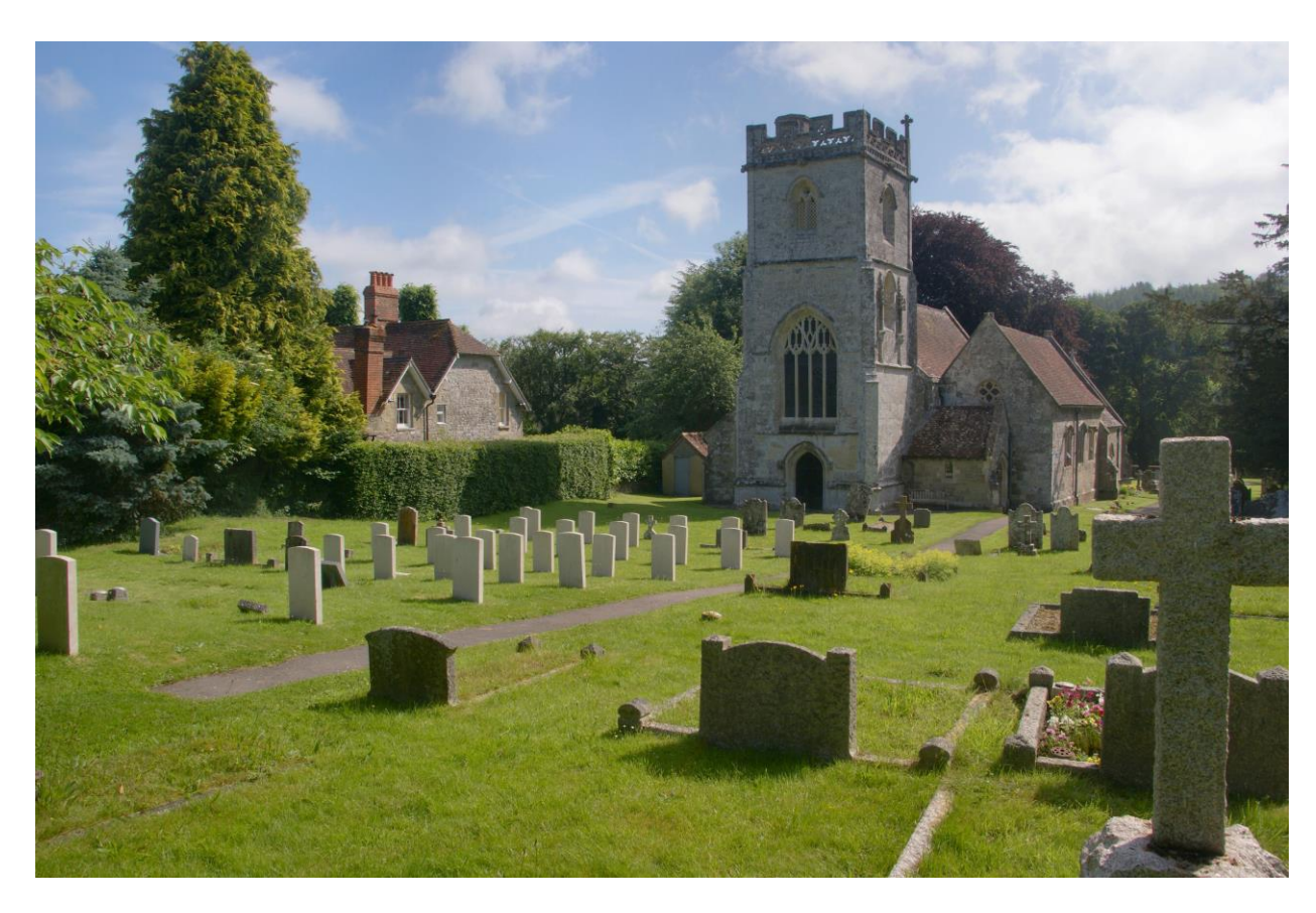
St George's Churchyard, Fovant – War Graves at rear