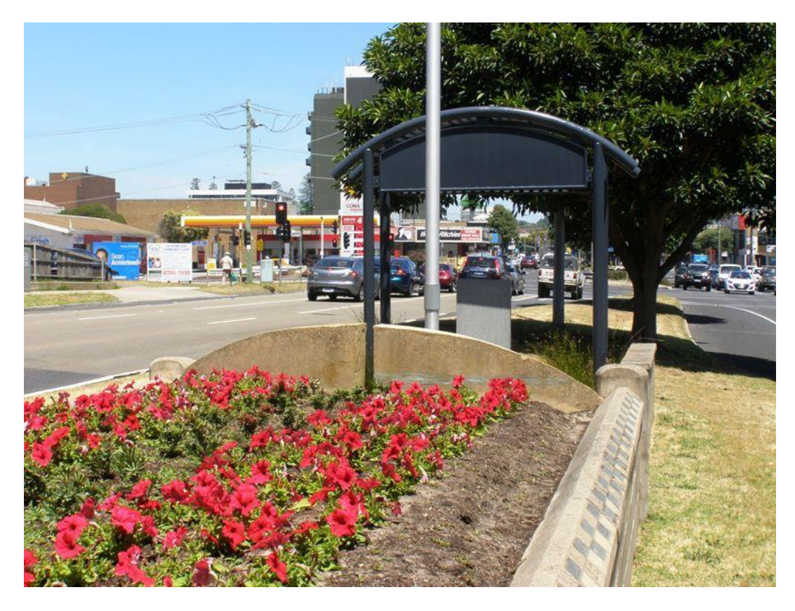
Avenue of Honour Monument, Frankston