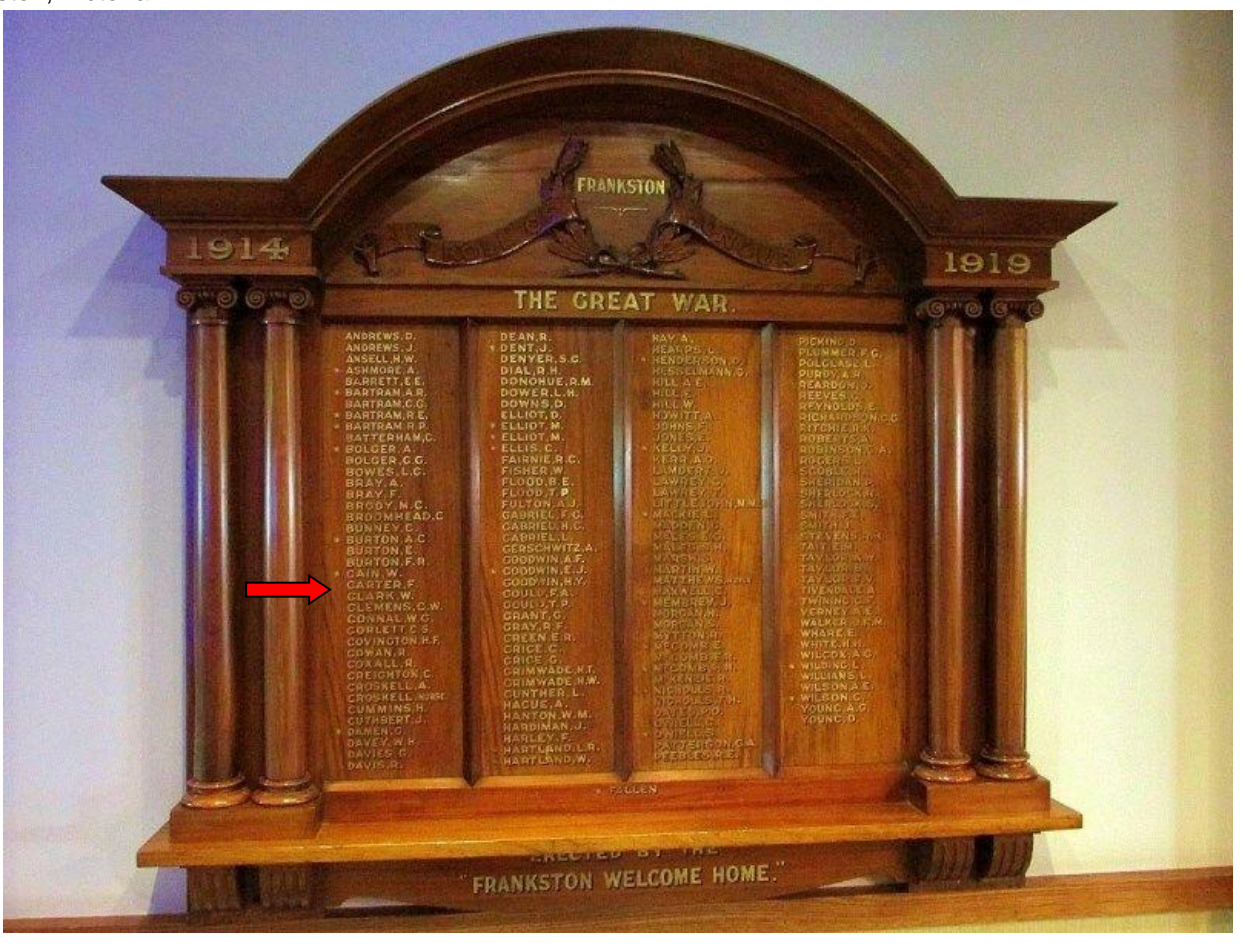
Frankston Honour Roll