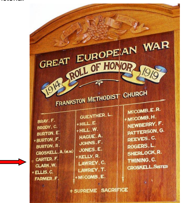
Frankston Methodist Church Honour Roll