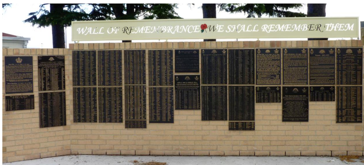
Wall of Remembrance, St. Helens, Tasmania

"What these men did nothing can alter now. The good and the bad, the greatness and the smallness of their story will stand. Whatever of glory it contains nothing now can lessen. It rises, as it will always rise, above the mists of ages, a monument to great hearted men; and for their nation, a possession forever. "