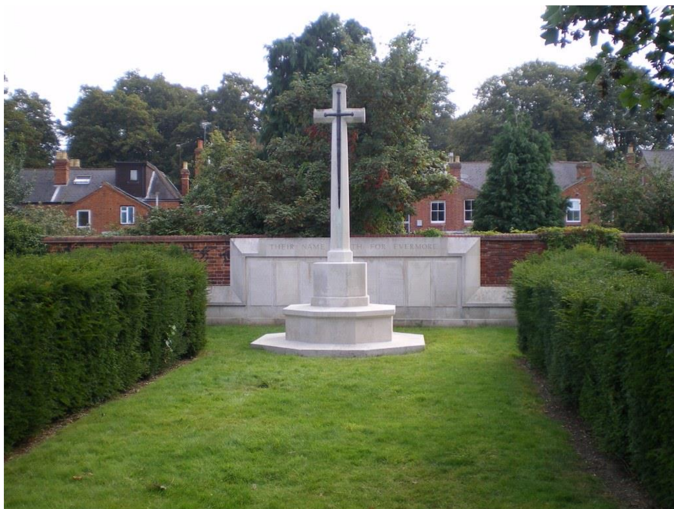
Cross of Sacrifice & Memorial Screen Wall, Reading Cemetery, Reading, Berkshire