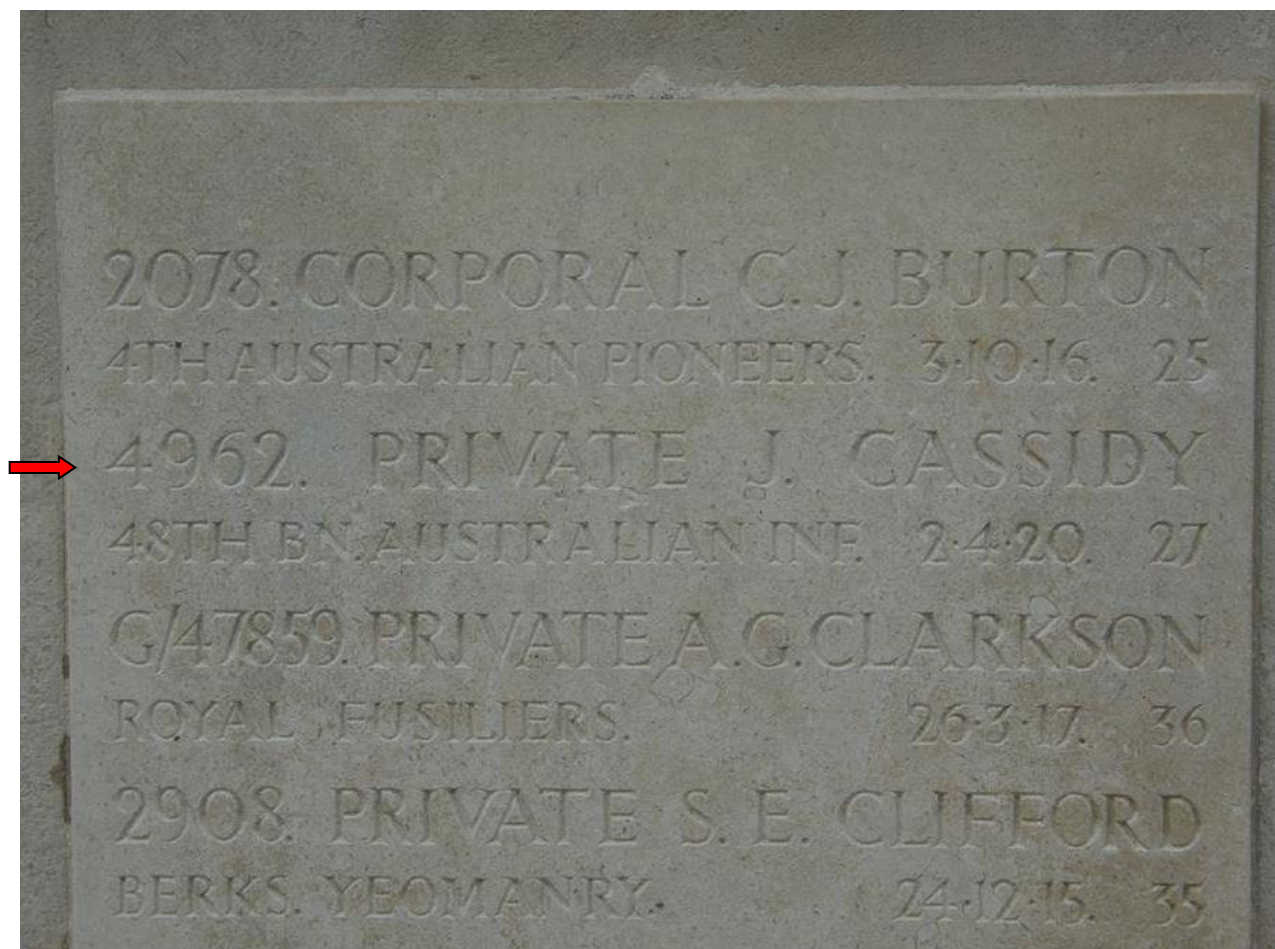
Photo of Private J. Cassidy's name on the Screen Wall Memorial in Reading Cemetery, Reading, Berkshire, England.