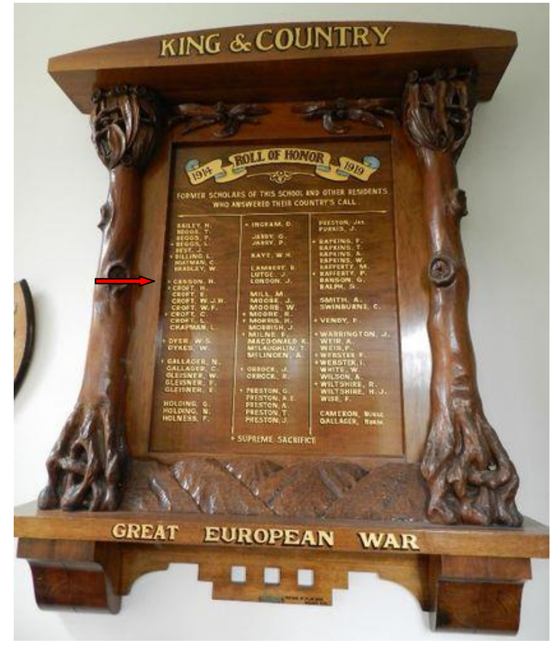
Elmhurst State School Honour Roll