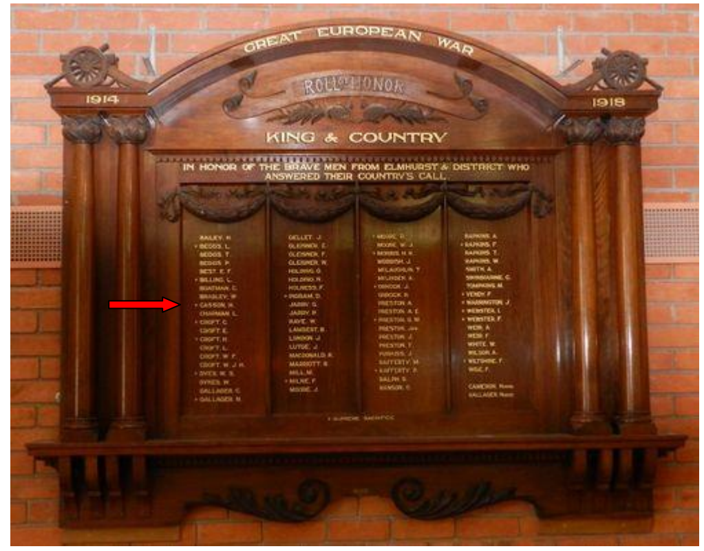
Elmhurst & District Honour Roll