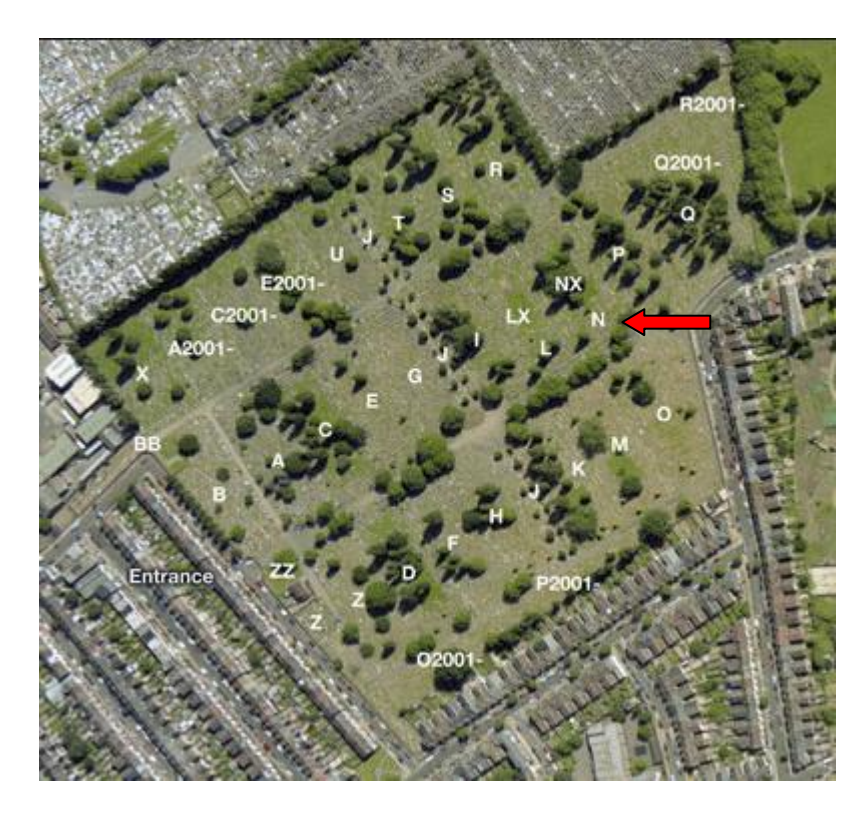
Map of Willesden New Cemetery