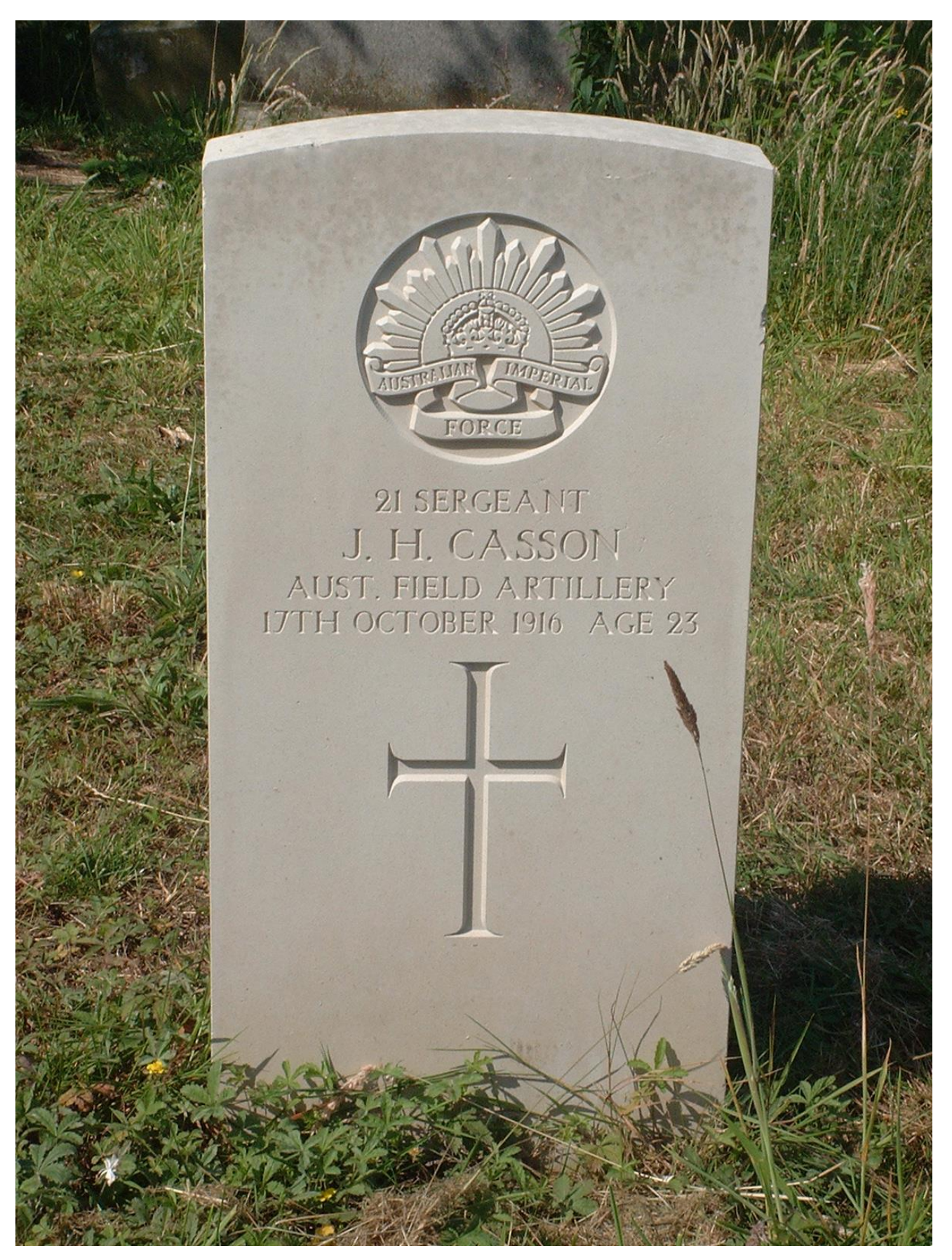
Photo of Sergeant J. H. Casson's Commonwealth War Graves Commission Headstone in Willesden New Cemetery, Willesden, Greater London, England.