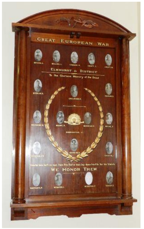
Elmhurst & District Photographic Honour Roll