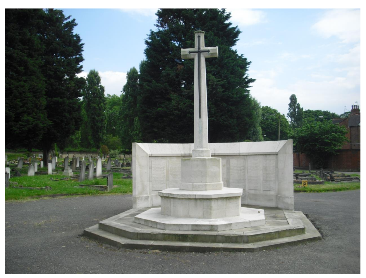
Cross of Sacrifice in Willesden New Cemetery