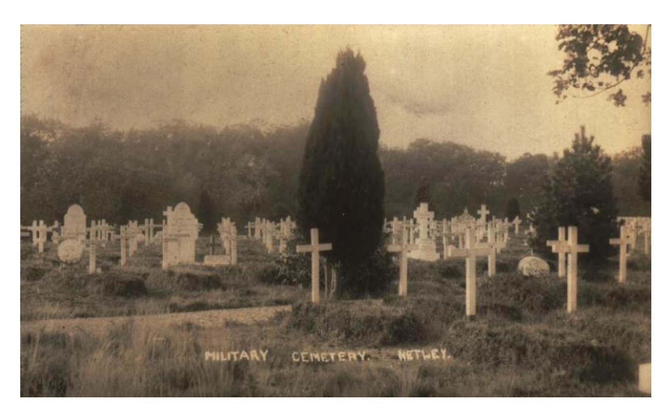
Original Cross markers – Netley Military Cemetery