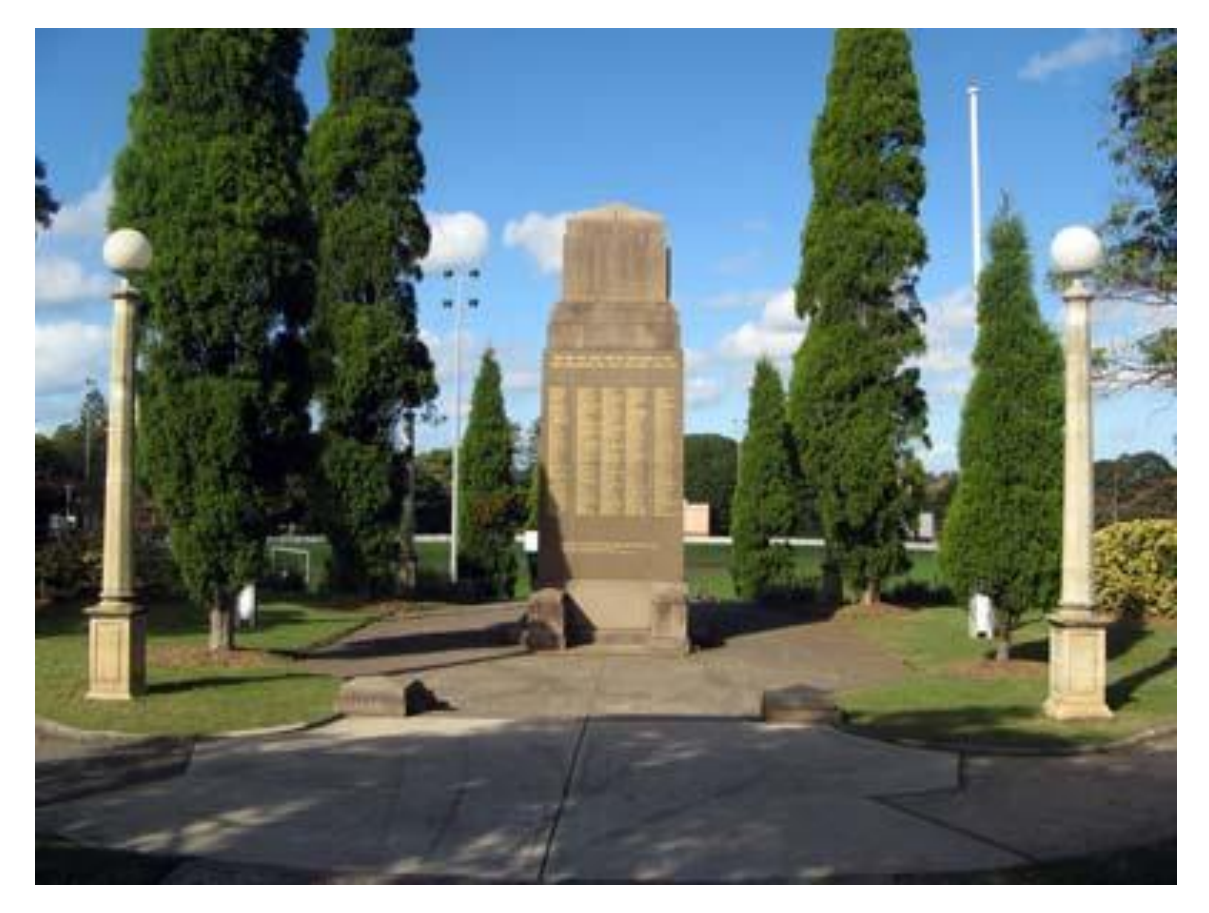
Mosman War Memorial