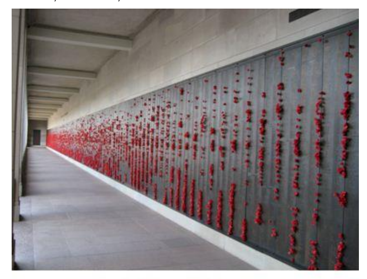
Roll Of Honour WW1 Australian War Memorial Canberra, Australia

Private T. E. Cholerton is commemorated on the Roll of Honour, located in the Hall of Memory Commemorative Area at the Australian War Memorial, Canberra, Australia on Panel 93.