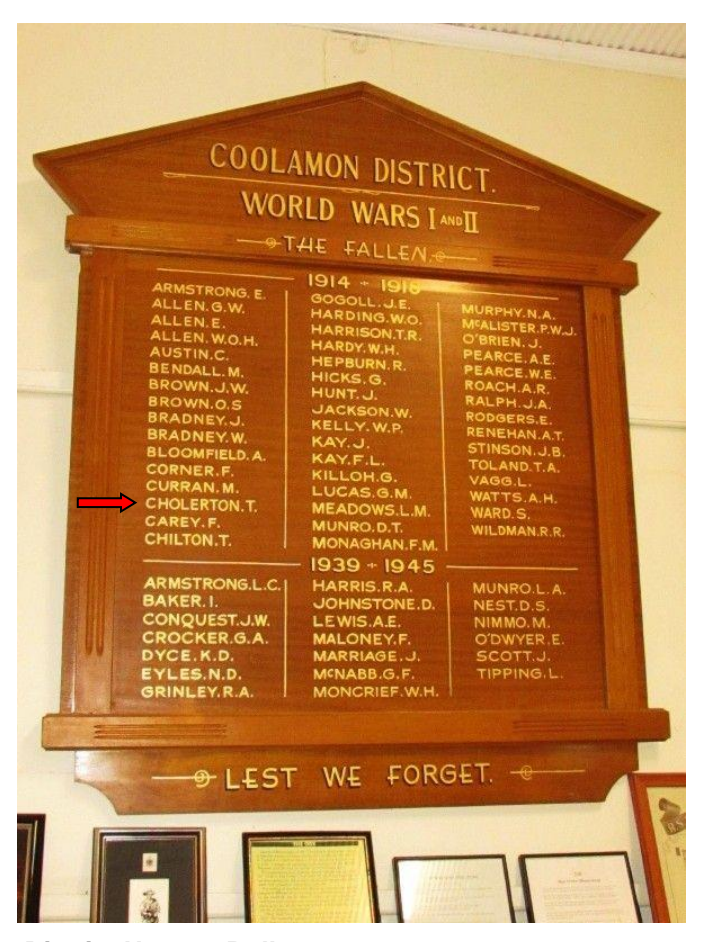
Coolamon District Honour Roll