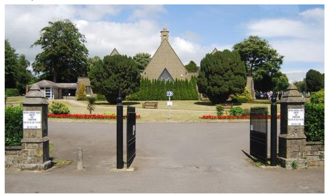
Entrance to Hastings Cemetery