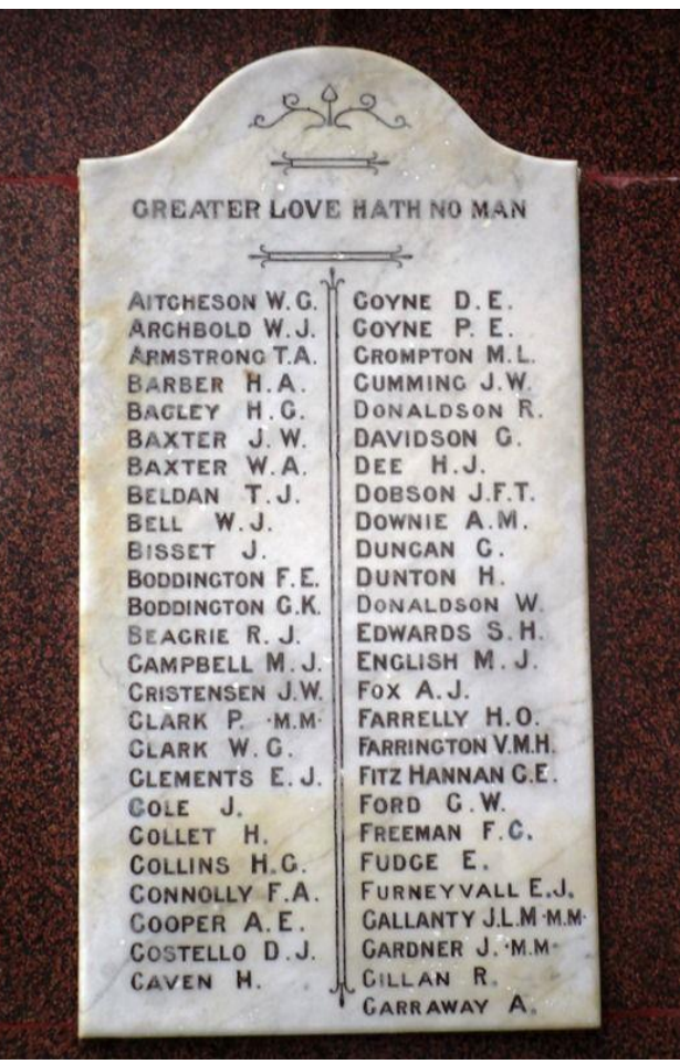
Mackay Cenotaph