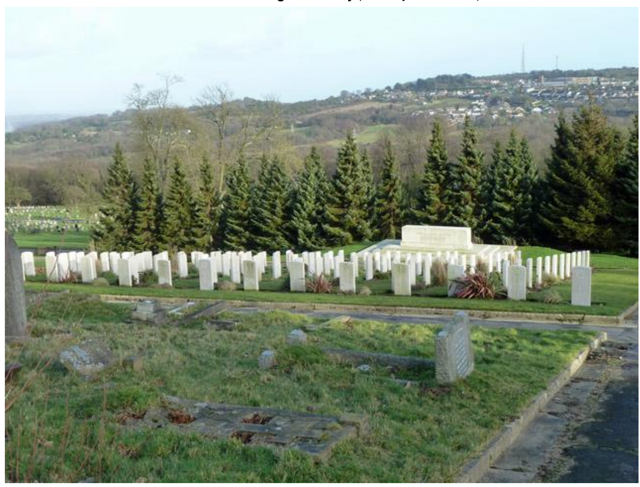
War Graves in Hastings Cemetery