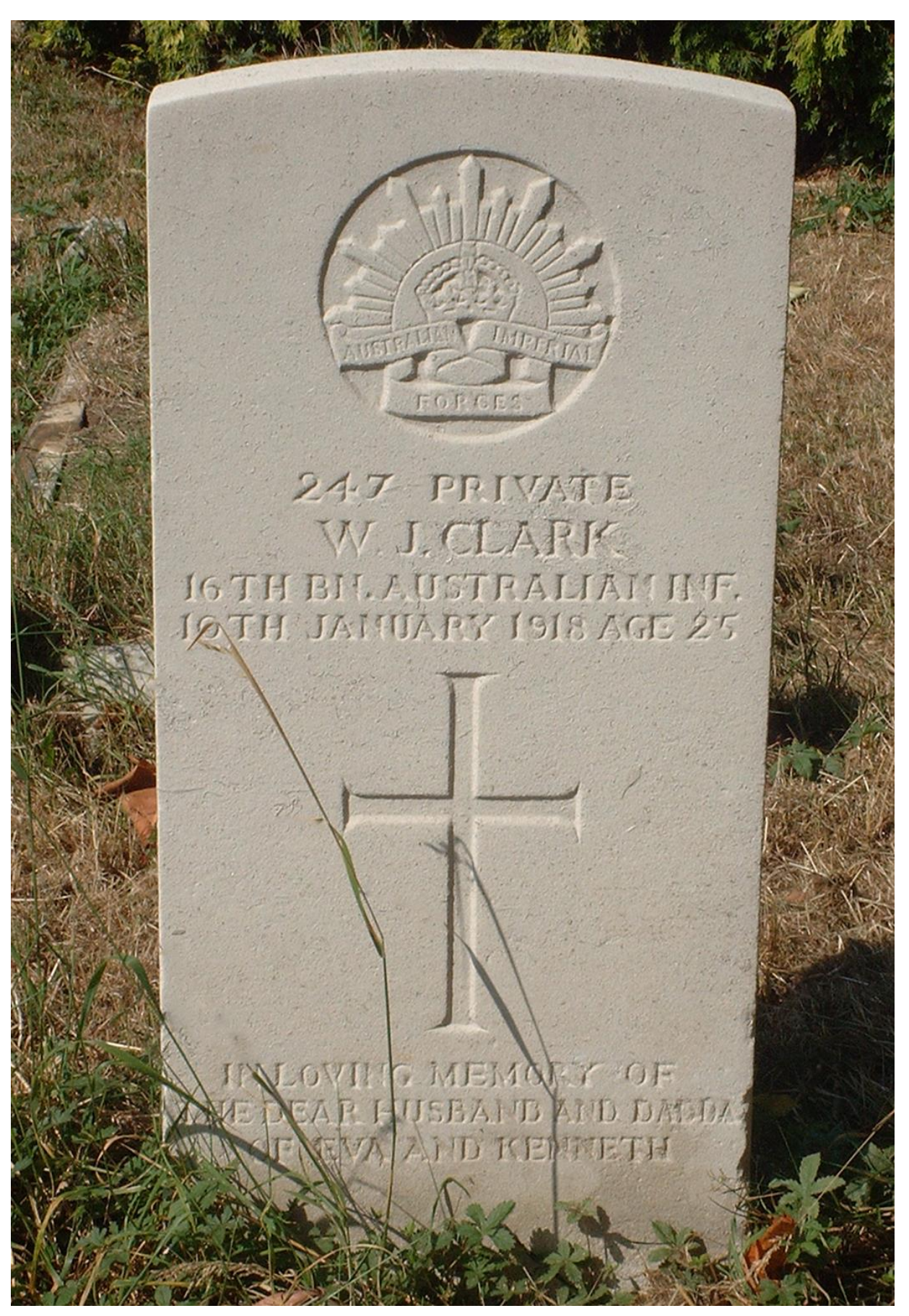
Photo of Private W. J. Clark's Commonwealth War Graves Commission Headstone in Willesden New Cemetery, Willesden, Greater London, England.