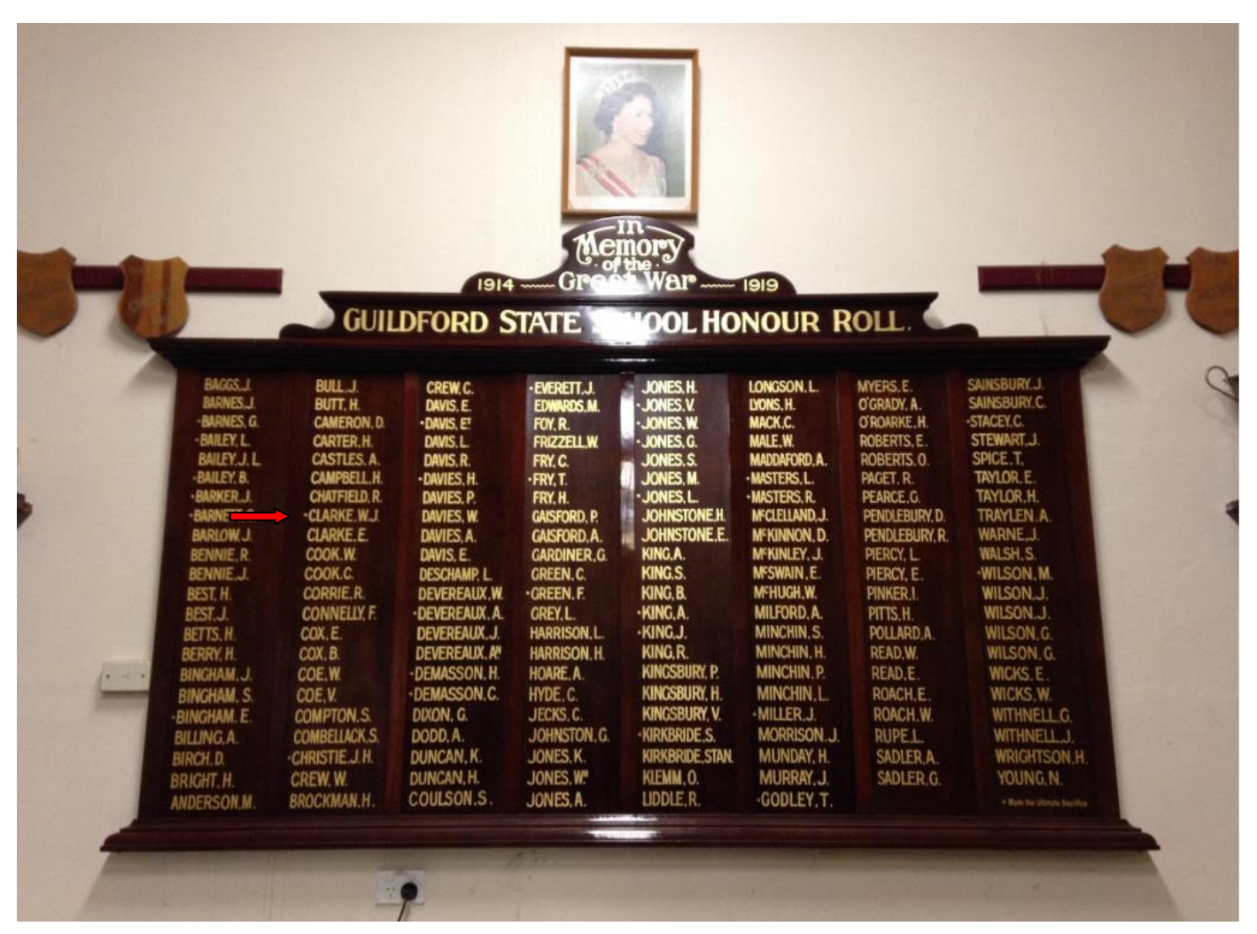
Guildford State School Honour Roll