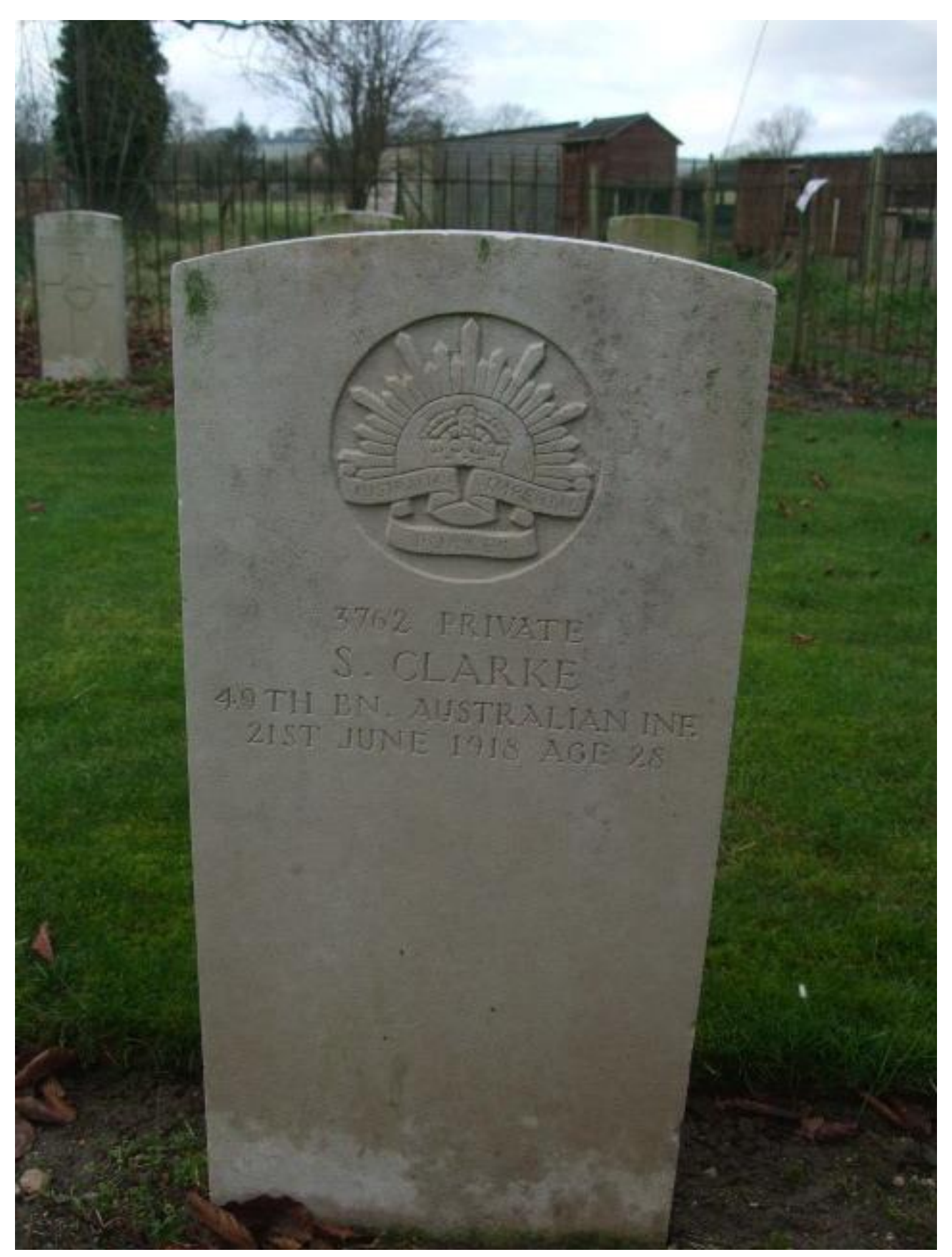
Photo of Private S. Clarke's Commonwealth War Graves Commission Headstone in St. Mary's New Churchyard, Codford, Wiltshire, England. Also known as Codford Anzac War Graves Cemetery, Wiltshire.