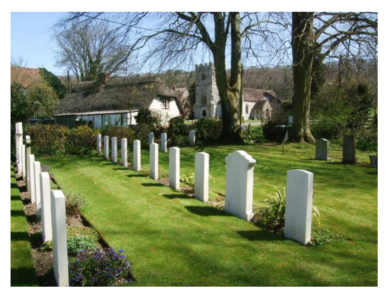
St. Mary's New Churchyard, Codford