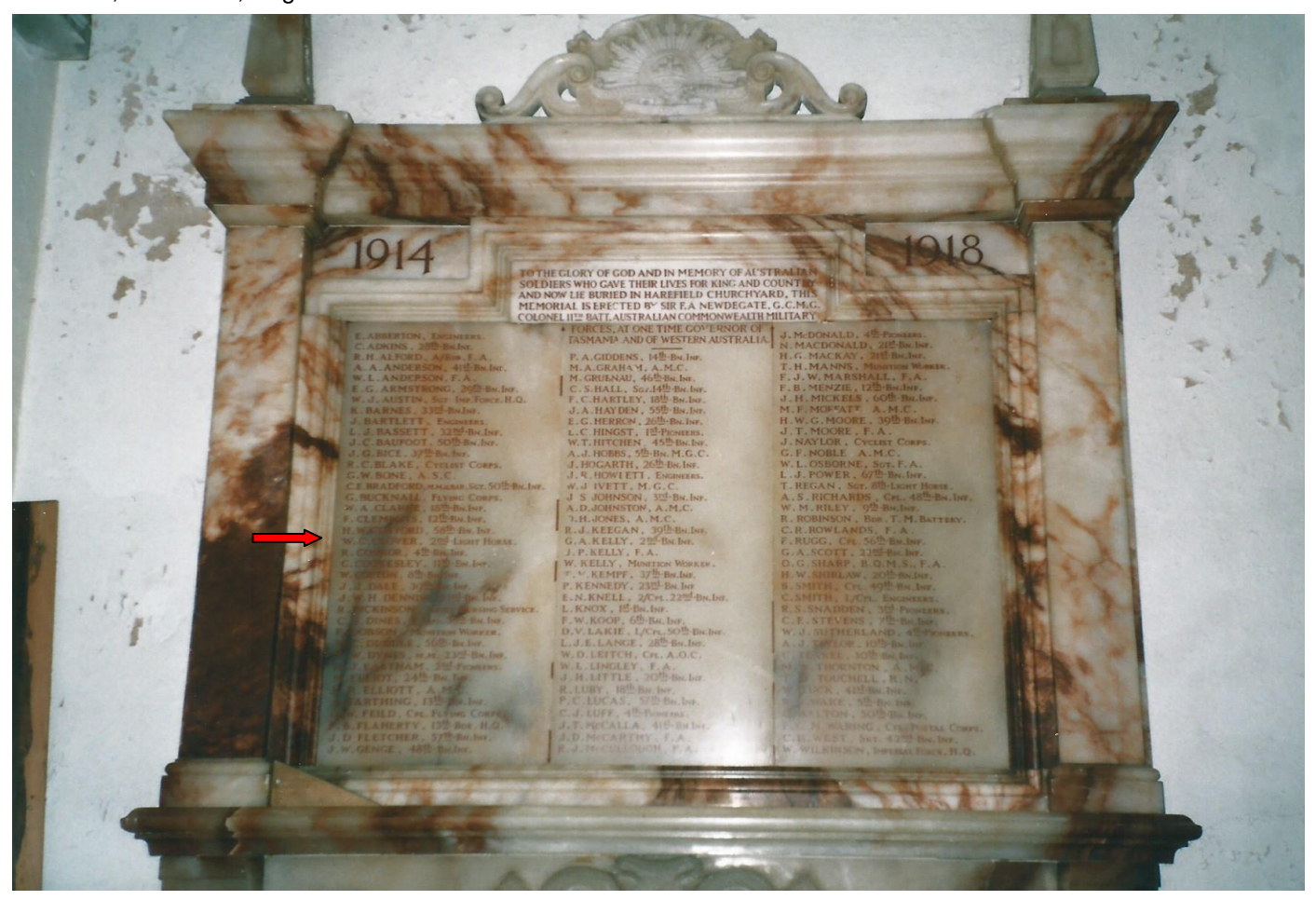
Australian Soldiers' Memorial, Harefield