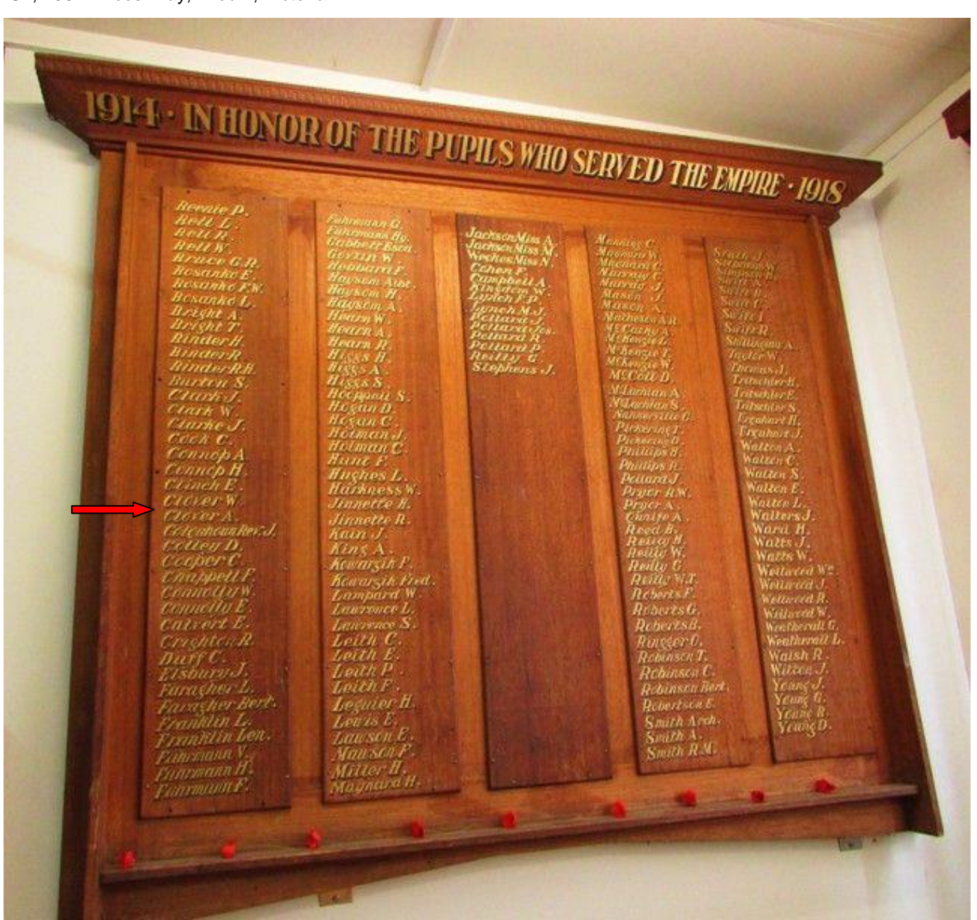
Drouin State School Honour Roll