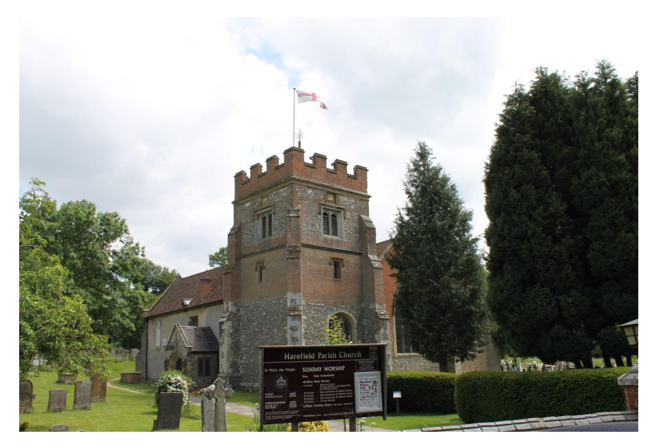
St Mary the Virgin Church, Harefield