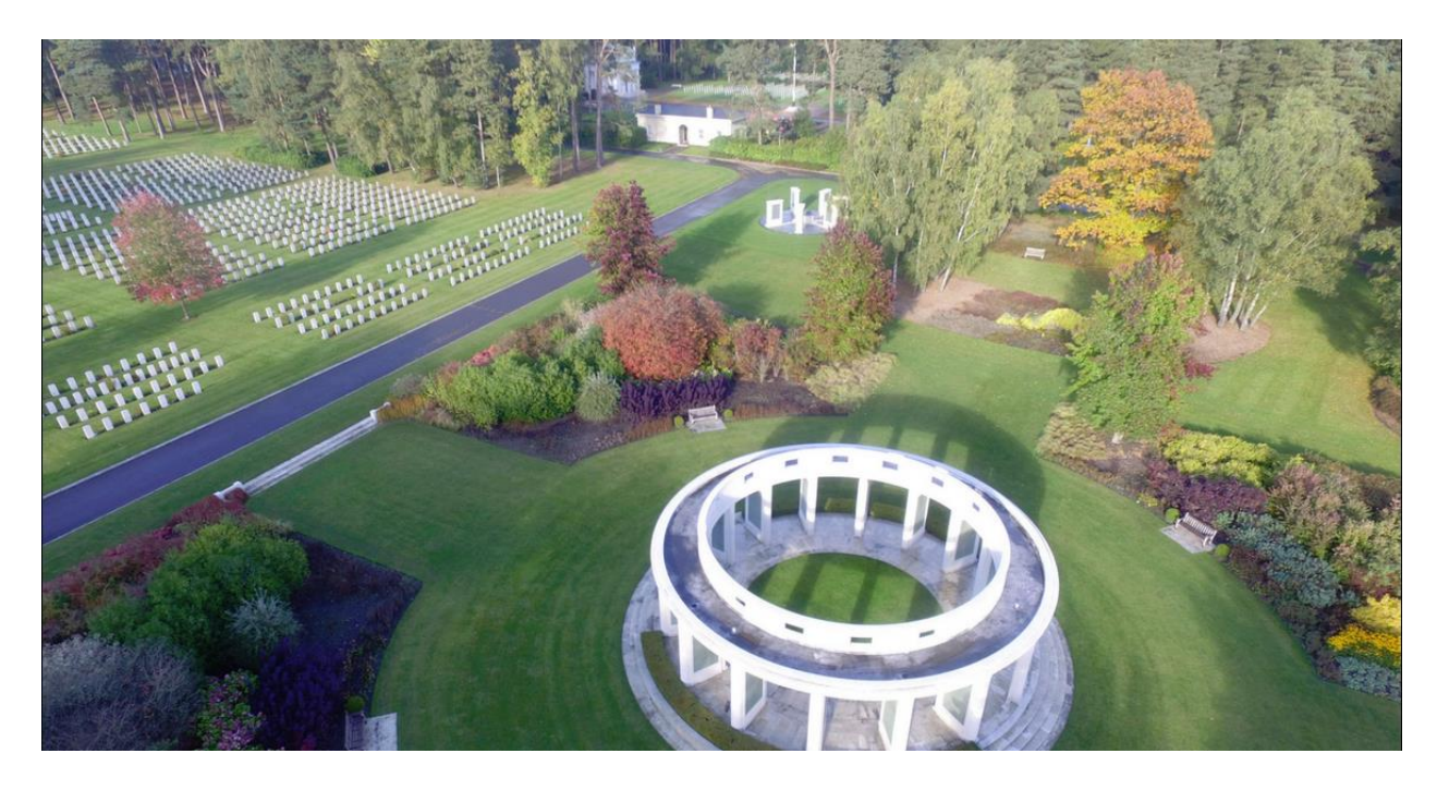
Brookwood Military Cemetery