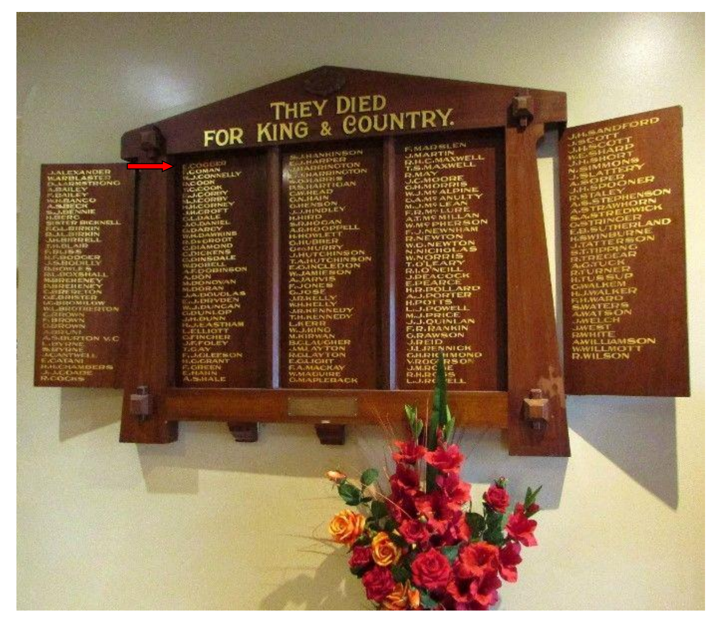
Kyneton RSL Honour Roll