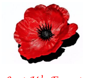
Lest We Forget