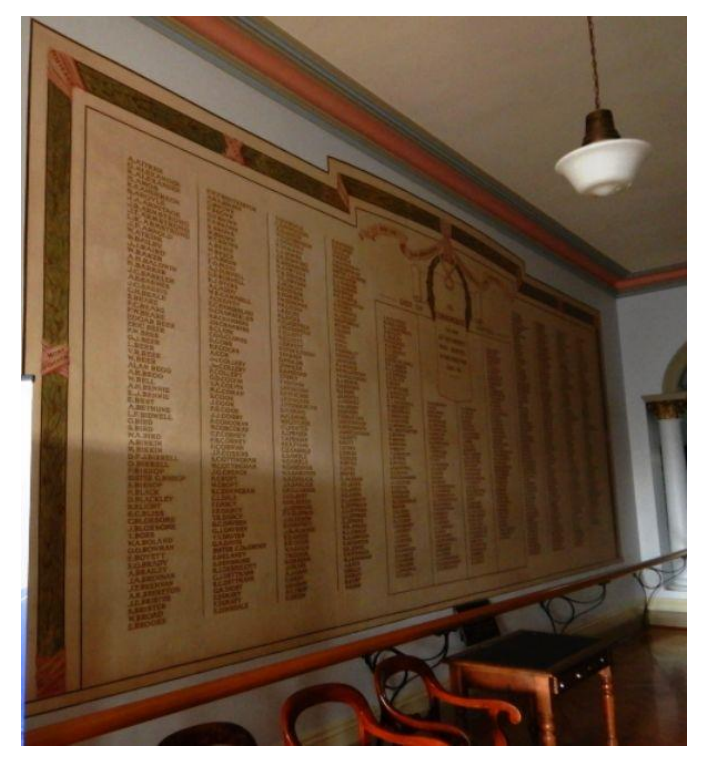
Kyneton Honour Roll