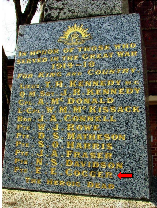
Metcalfe War Memorial

(52 pages of Private Emile Ernest Cogger's Service records are available for On Line viewing at National Archives of Australia website).