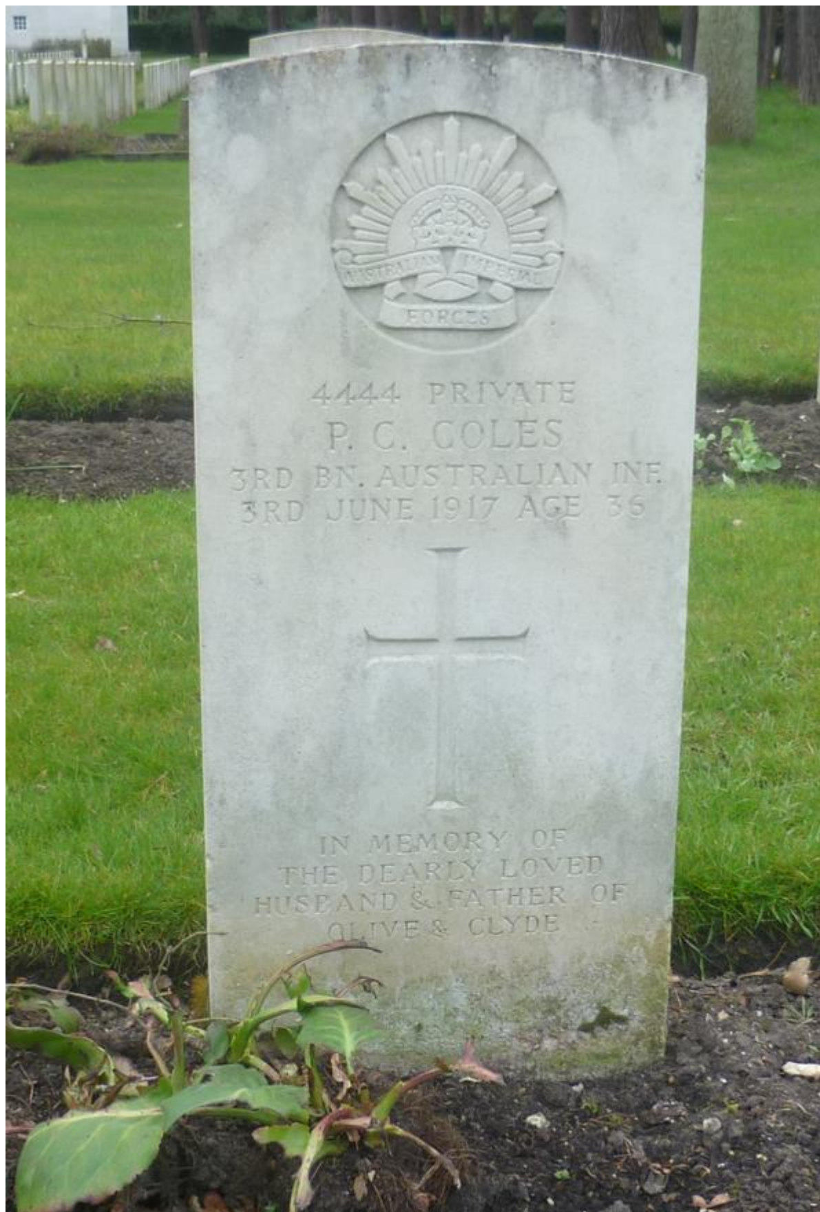
Photo of Private P. C. Coles' Commonwealth War Graves Commission Headstone in Brookwood Military Cemetery, Surrey, England.