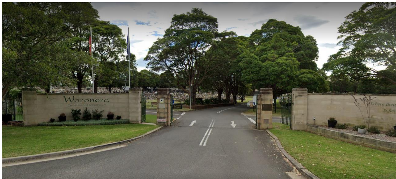
Woronora Memorial Park