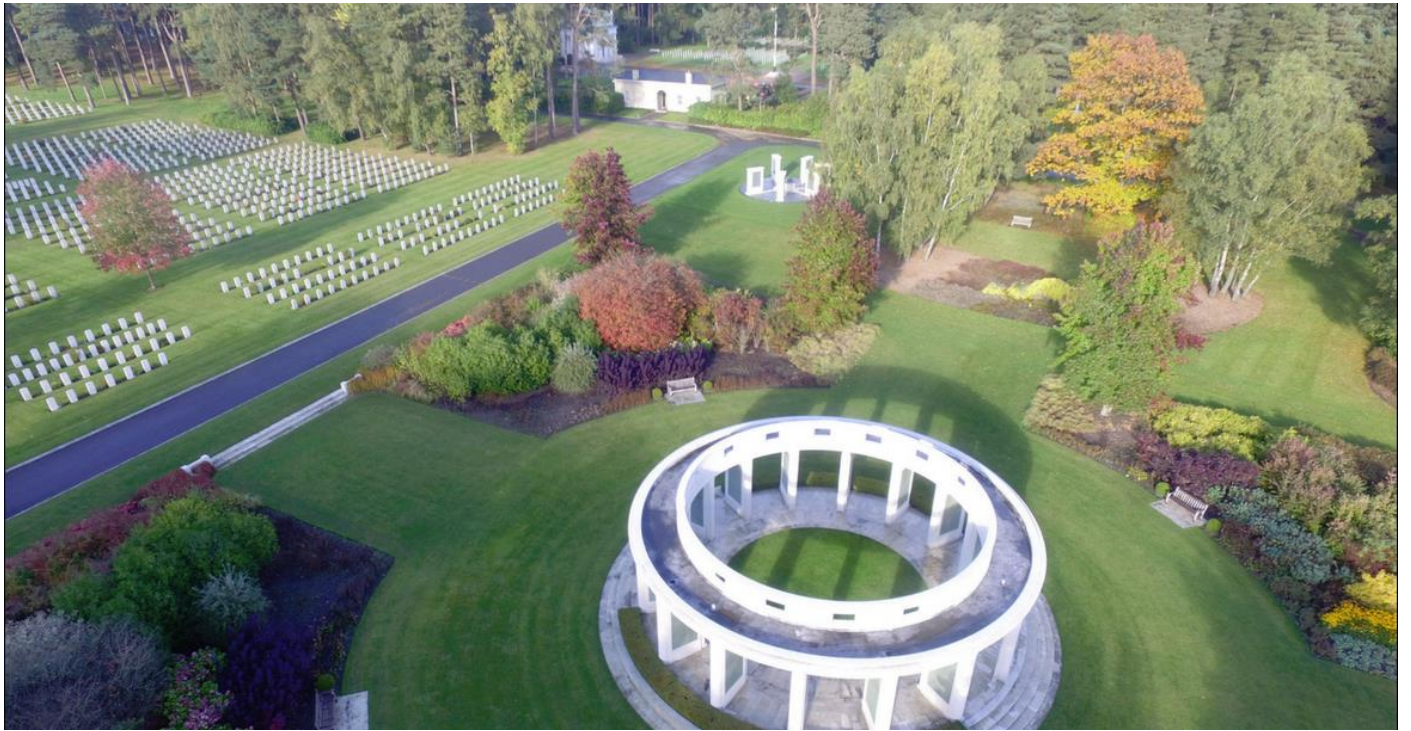
Brookwood Military Cemetery