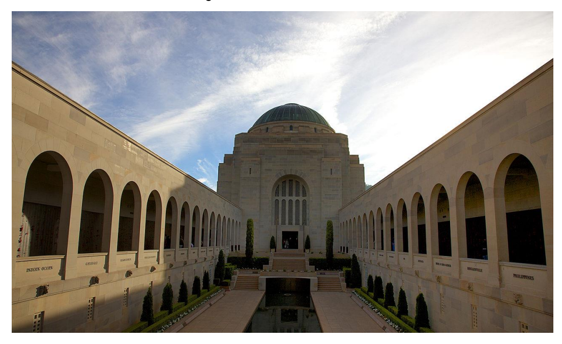
Commemorative Area of the Australian War Memorial