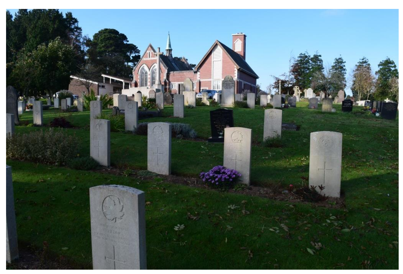
War Graves in Efford Cemetery, Plymouth