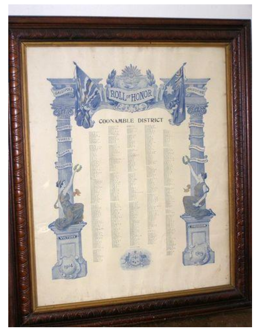
Coonamble District Roll of Honour

The Coonamble District Roll of Honour is a framed paper roll which commemorates those from the District who served in World War One. It is located in Coonamble RSL, 18 Castlereagh Street, Coonamble, NSW.