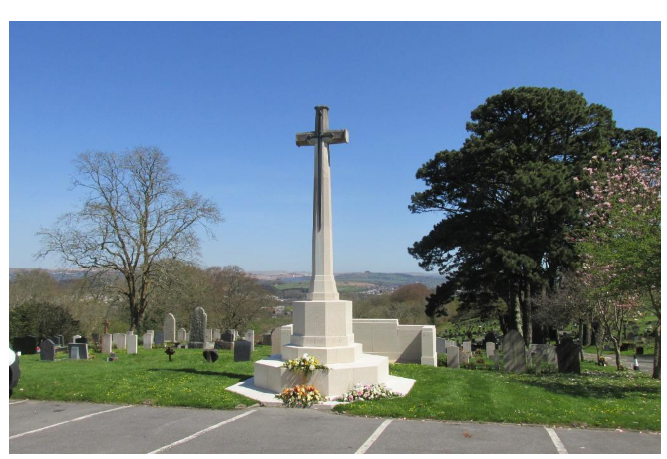
Cross of Sacrifice in Efford Cemetery, Plymouth