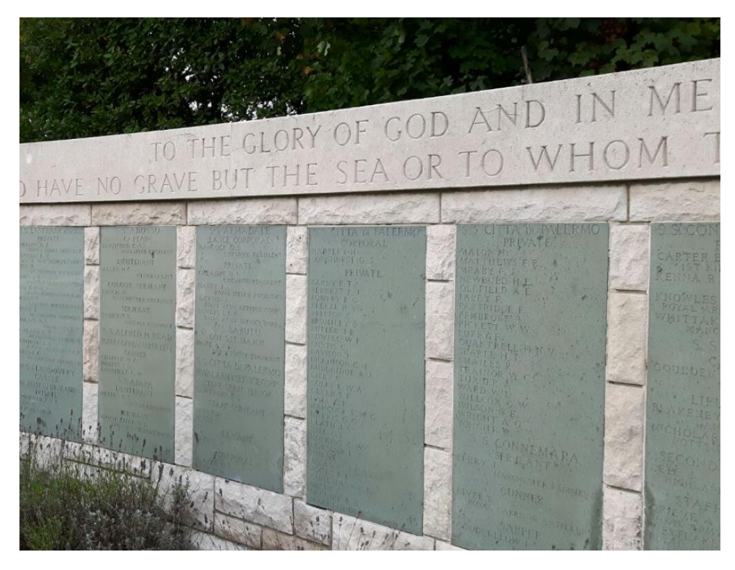
Name Panels behind Cross of Sacrifice