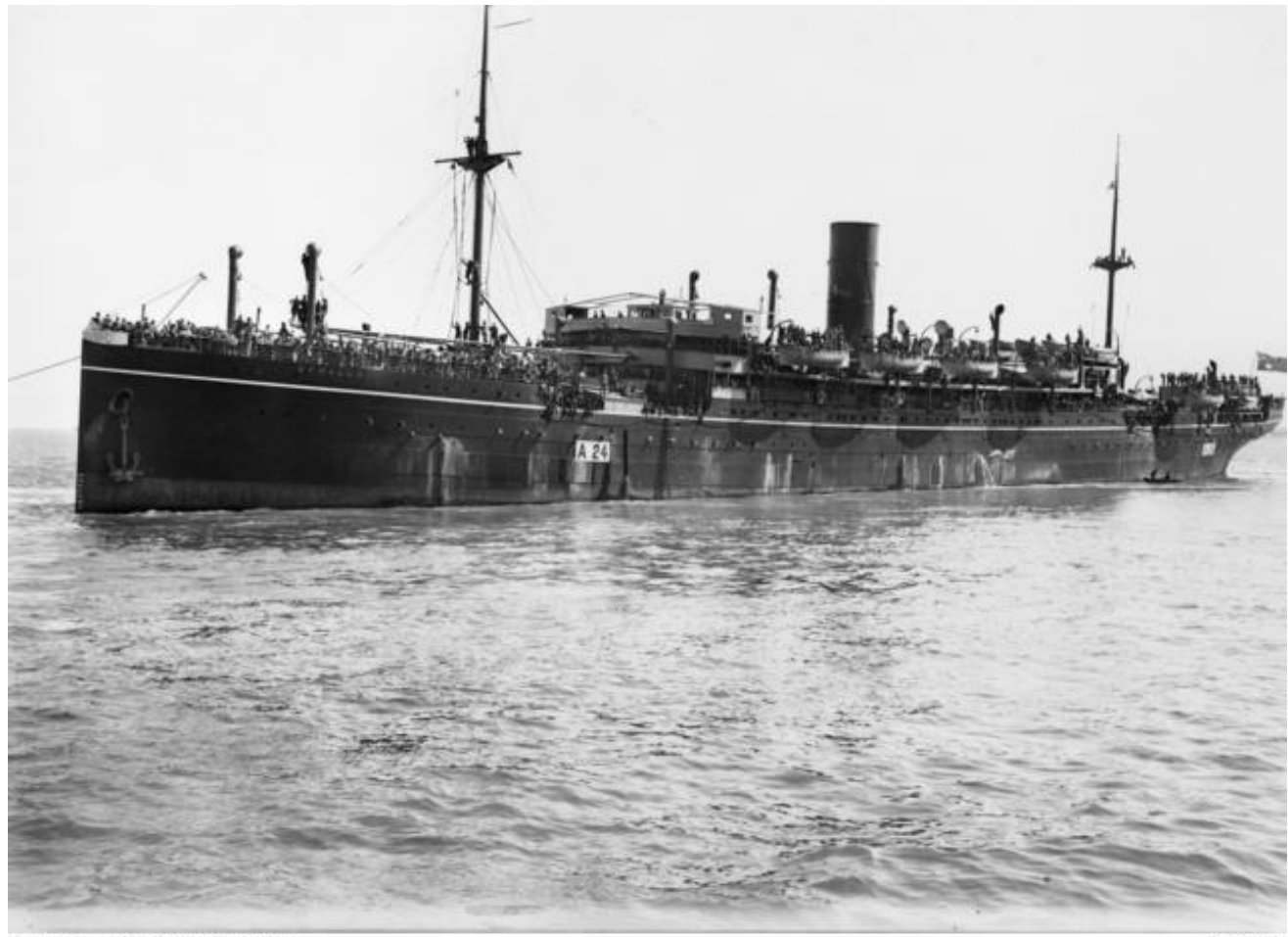
AUSTRALIAN WAR MEMORIAL PB0246