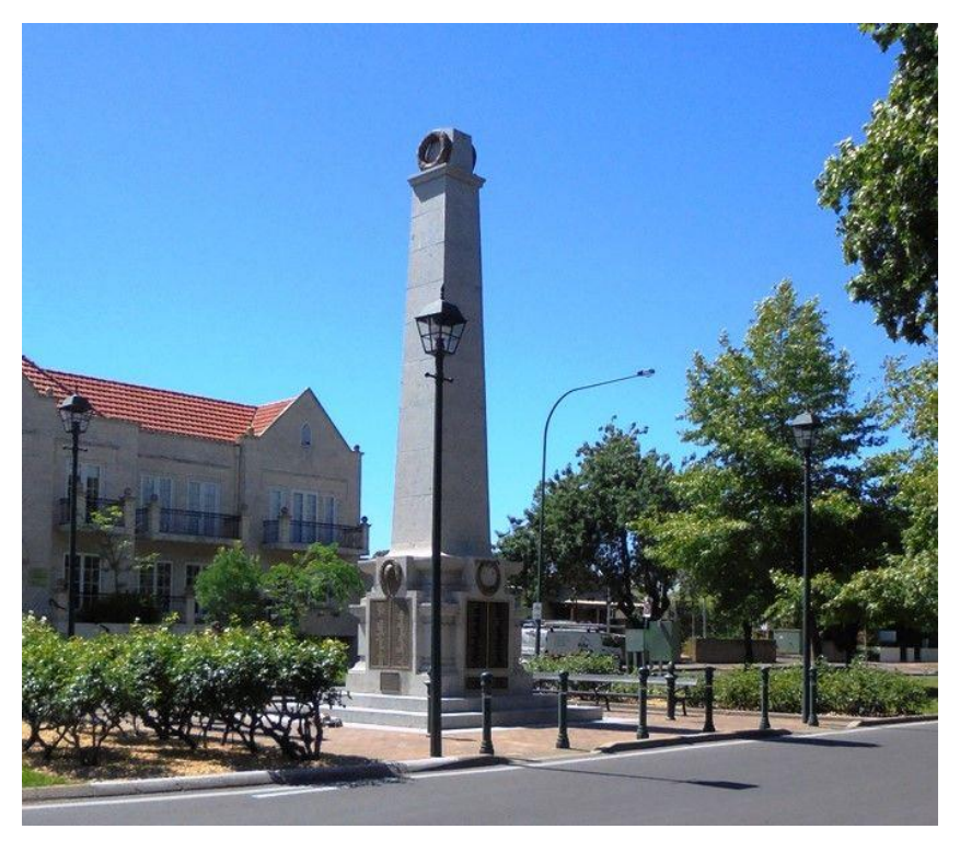
Norwood War Memorial

Private C. Compton is remembered on the Norwood War Memorial, located at Osmond Terrace & The Parade, Norwood, South Australia.