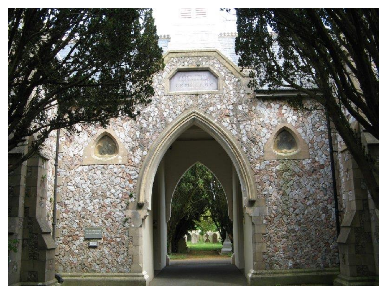
Broadwater Cemetery, Worthing

Broadwater Cemetery, Worthing contains 81 Commonwealth War Graves – 78 from World War 1 & 3 from World War 2.