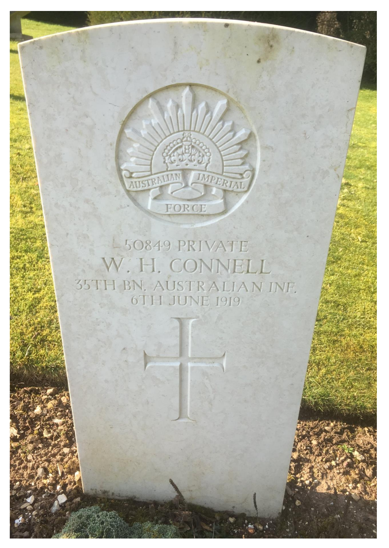
Photo of Private W. H. Connell's Commonwealth War Graves Commission Headstone in Tidworth Military Cemetery, Wiltshire, England.