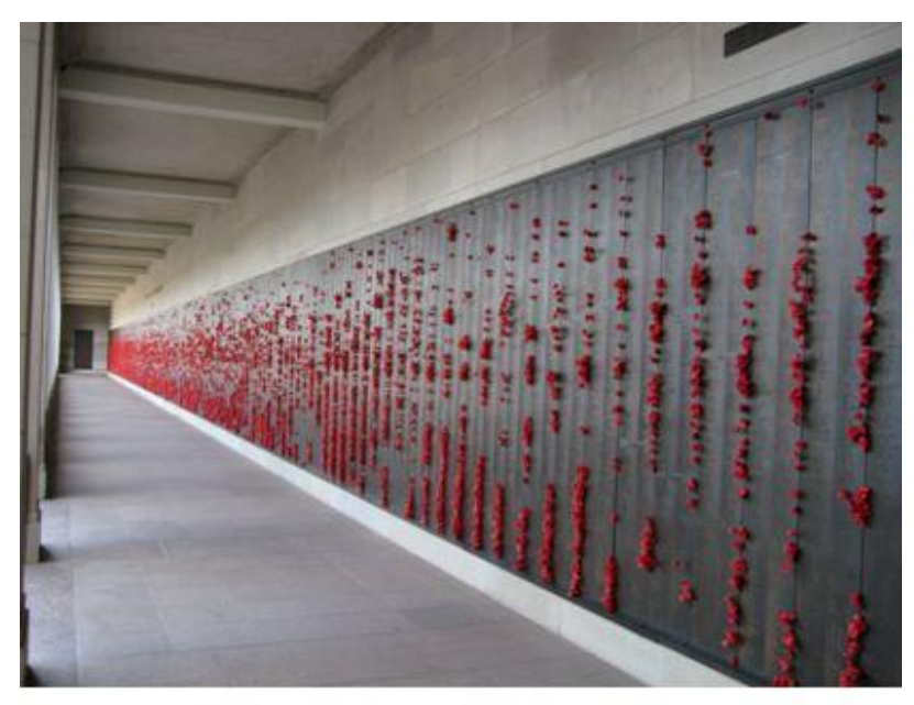
Roll Of Honour WW1 Australian War Memorial Canberra, Australia

Corporal C. W. Constable is commemorated on the Roll of Honour, located in the Hall of Memory Commemorative Area at the Australian War Memorial, Canberra, Australia on Panel 141.