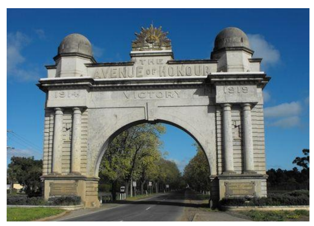
The Arch of Victory was built as an entrance to the Avenue of Honour

C. W. Constable is also remembered on the Ballarat Avenue of Honour (1917-1919) where almost 4,000 trees were planted to represent the number of men and women from the Ballarat district who served in World War 1. The trees were planted at intervals of 12 metres along 22 kms of the Ballarat-Burrembeet Road. The Ballarat Avenue of Honour is famous for being the first avenue of its kind in Australia. Tree number 912 Ulmus Sp. Planted by Miss C. Smith.