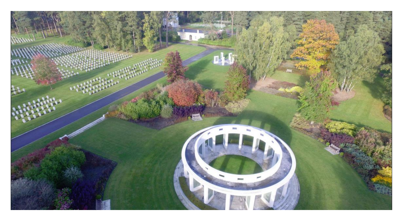
Brookwood Military Cemetery