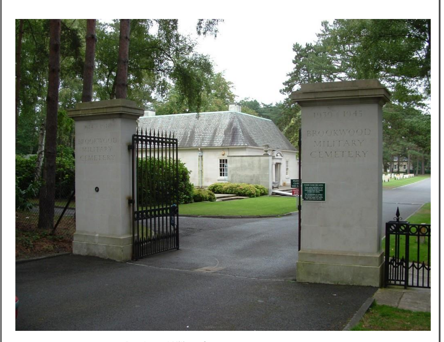
Brookwood Military Cemetery