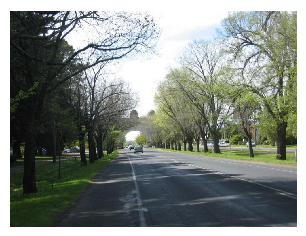
Ballarat Avenue of Honour

Corporal C. W. Constable is commemorated on the Roll of Honour, located in the Hall of Memory Commemorative Area at the Australian War Memorial, Canberra, Australia on Panel 141.