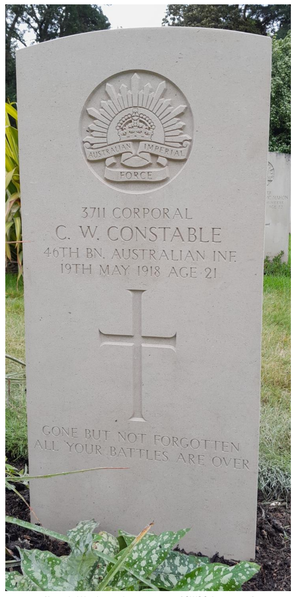
(Amended Headstone photo – courtesy of CWGC August 2021)