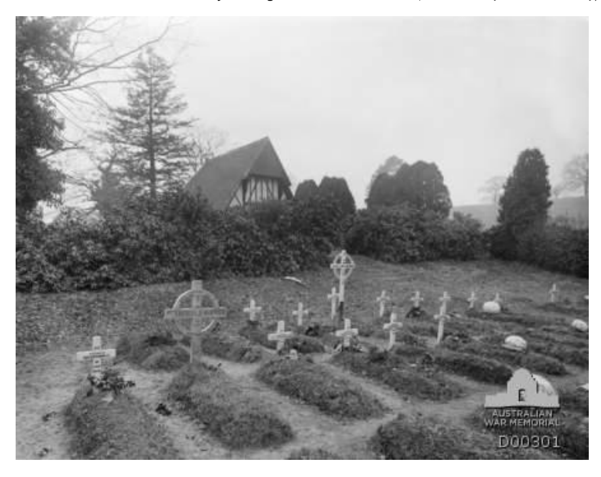
Graves of Australian soldiers in the cemetery at Compton-Chamberlyne, each marked by a cross.