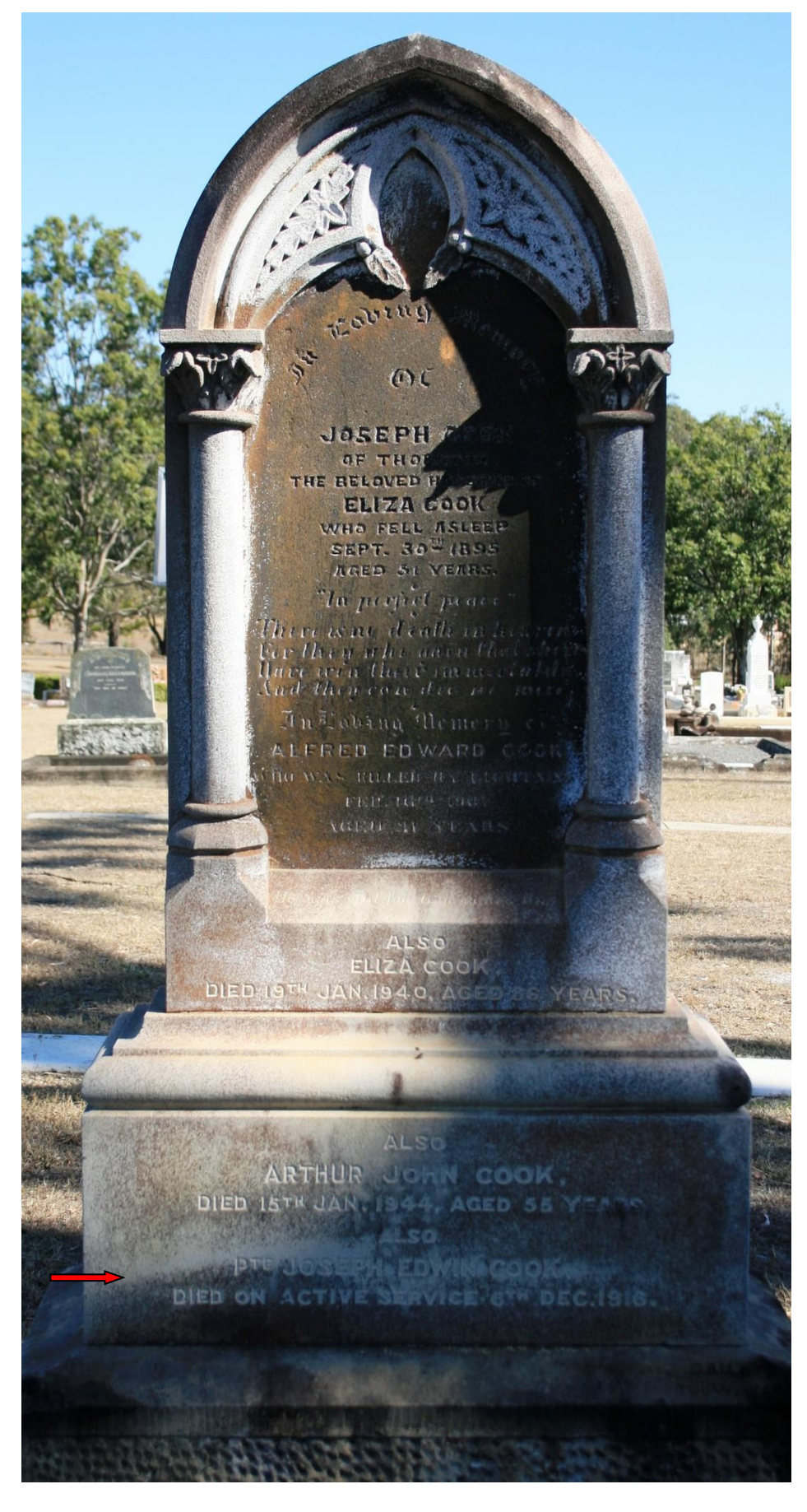
Cook Family Headstone in Laidley Cemetery, Queensland