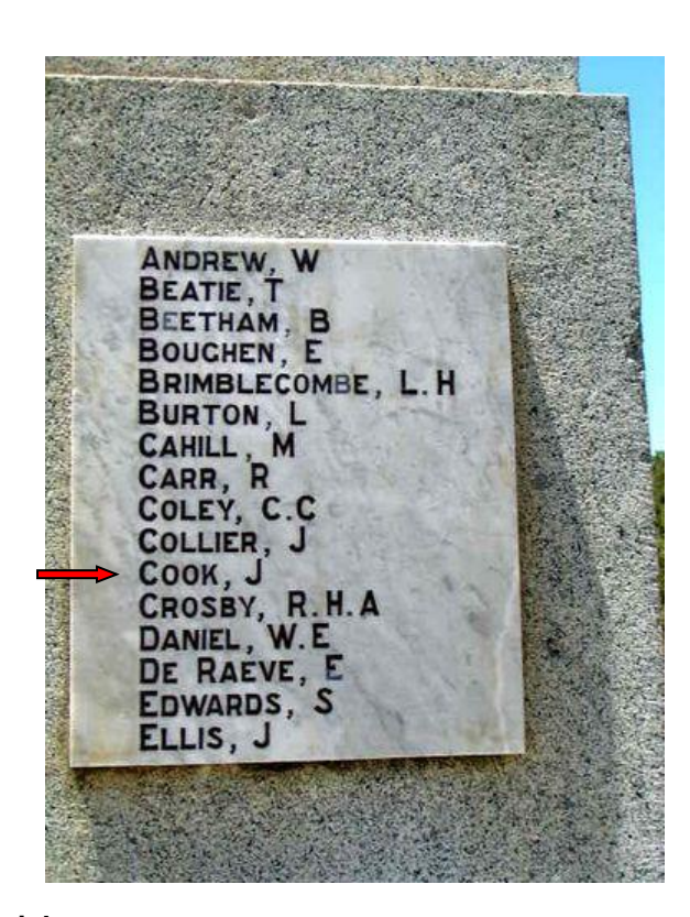
Laidley War Memorial