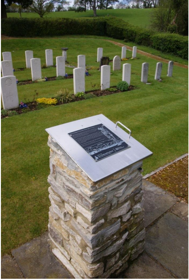
Left & right of Cemetery with central Plinth