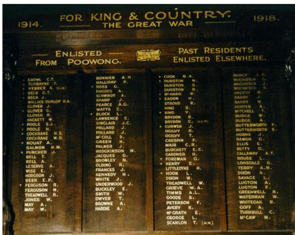
Poowong Hall Honour Roll

N. A Cook is also remembered on the Poowong Hall Honour Roll (First World War) located on Main Street, Poowong, South Gippsland Shire, Victoria. (3 rd Column, first name)