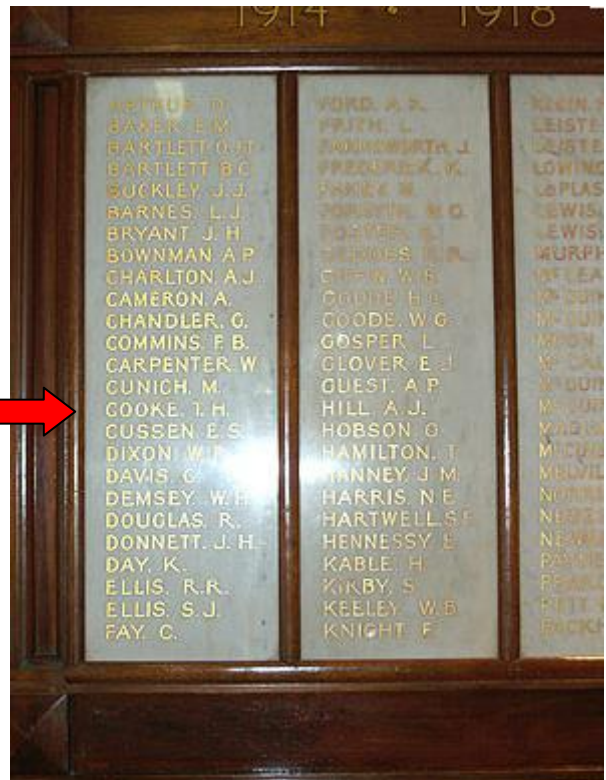
Parkes R.S.L. Roll of Honour