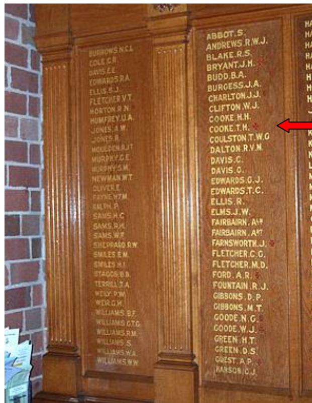
St George's Anglican Church, Parkes