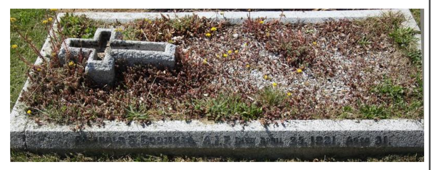
Photo of Private Reginald S. Coombes' Private Headstone in Campsdown Cemetery, Charlestown, Cornwall, England.