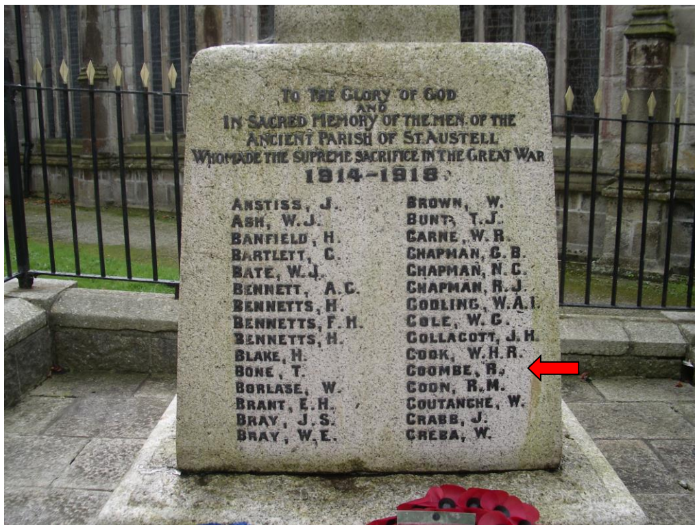
St. Austell War Memorial