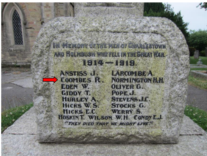
Charlestown and Holmbush War Memorial